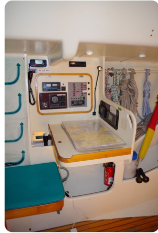
MSP_5277 - Kopie