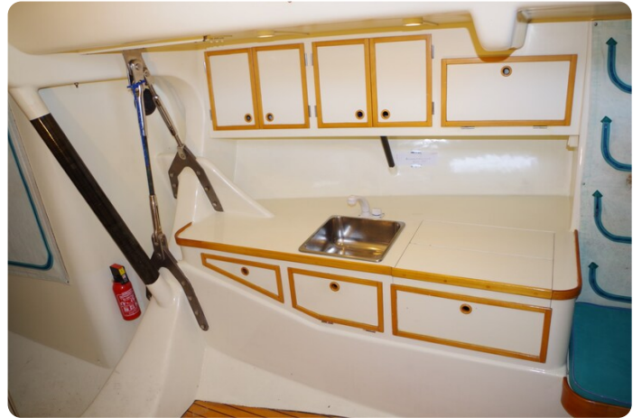
MSP_5304 - Kopie