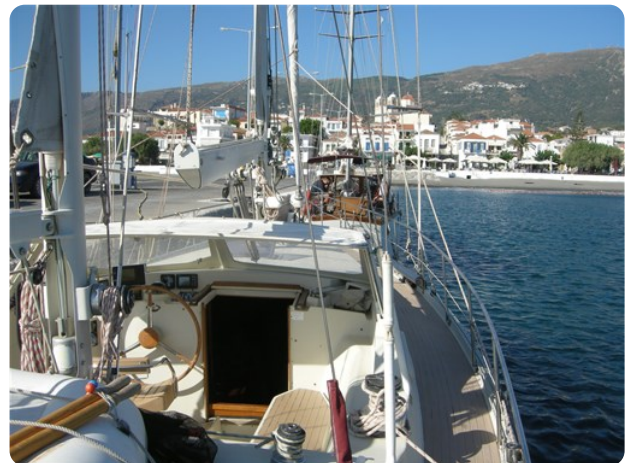
greicia 2013 227