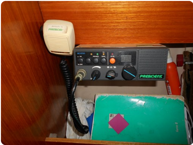
éléments techniques (3)