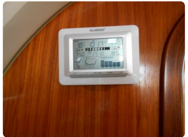
éléments techniques (16)