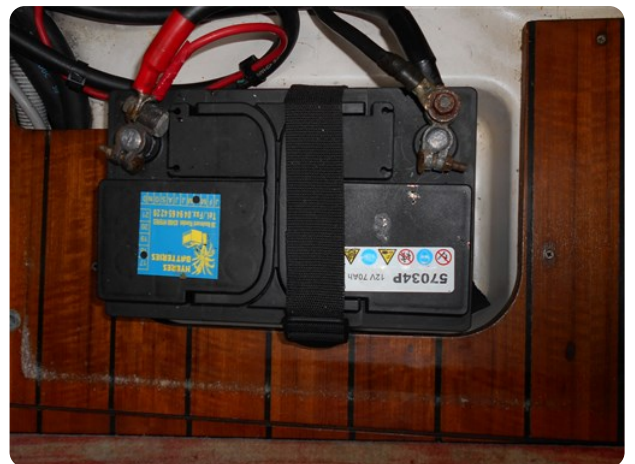
éléments techniques (8)