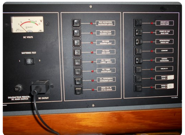
éléments techniques (2)