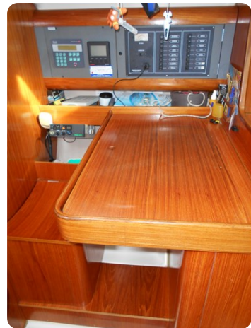
éléments techniques (13)