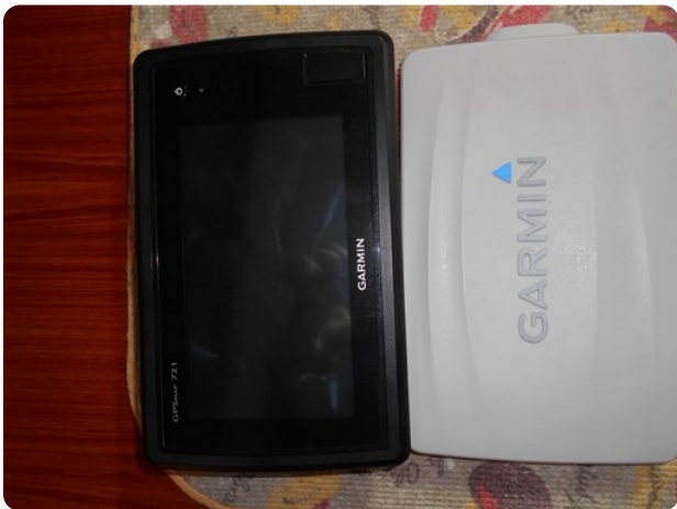
éléments techniques (17)