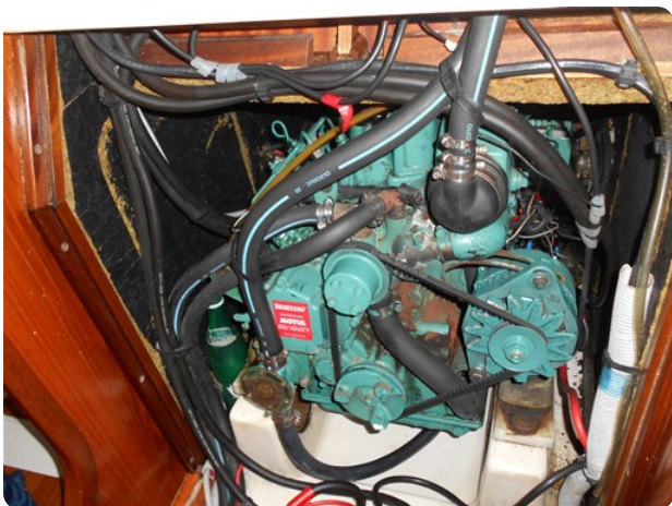
éléments techniques (6)