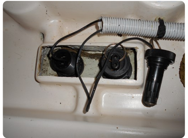
éléments techniques (5)