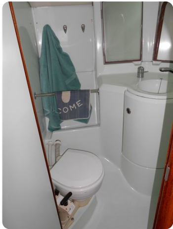
salle de bain (1)