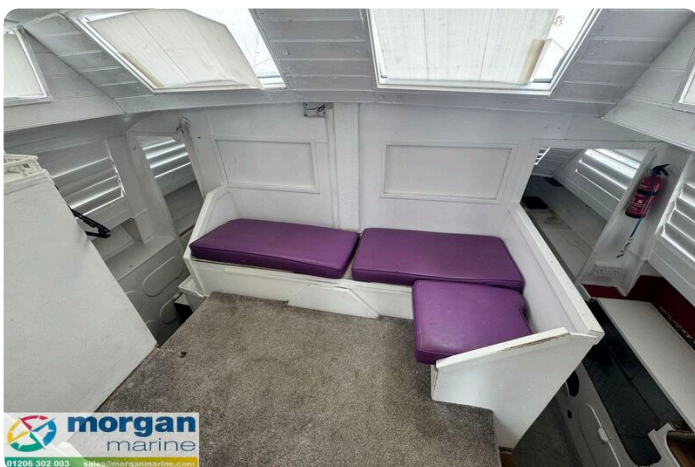
Bill O'brien Amazon MK1 Catamaran - saloon seating