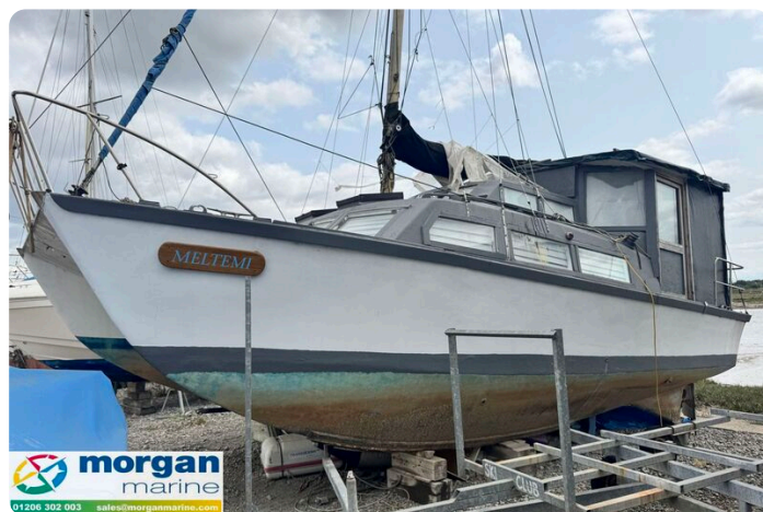
Bill O'Brien Amazon MK1 Catamaran - side view