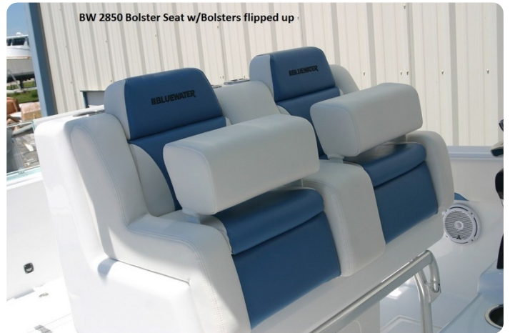
BW 2850 Bolster Seat w/Bolsters flipped up