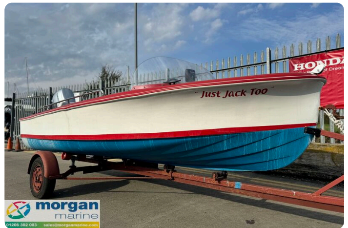
Classic mid-1970s river launch-main