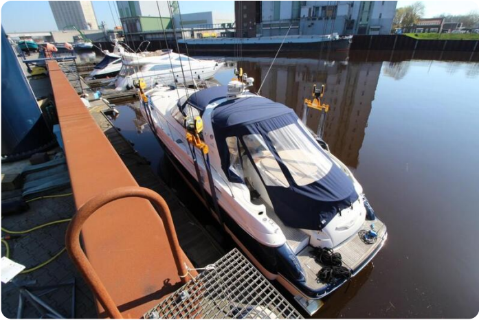
Cranchi Mediterranea 50