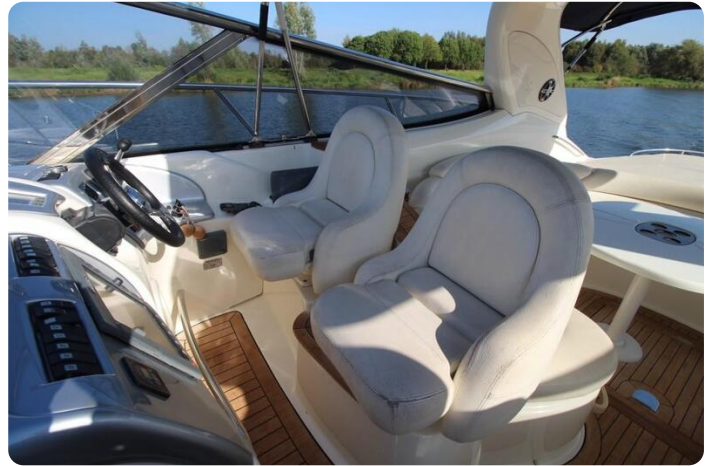
Cranchi Mediterrannée 50