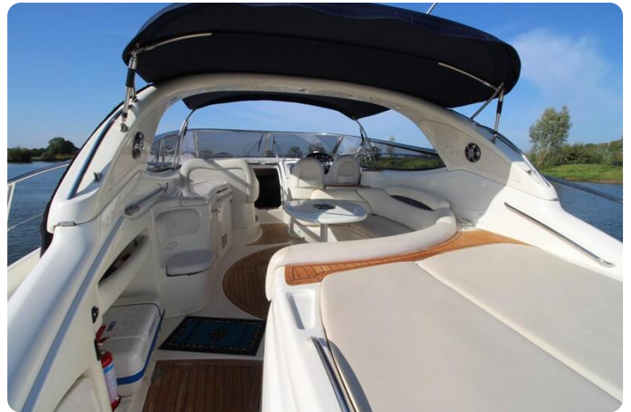
Cranchi Mediterrannée 50