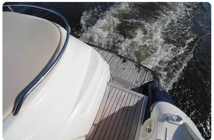
Cranchi Mediterrannée 50