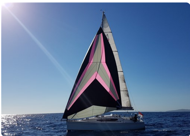
D 29 Code D