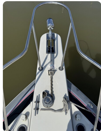
Formula BALU 8