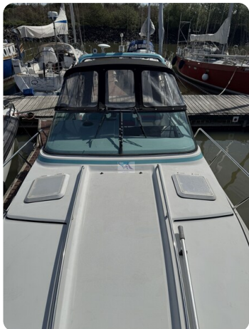
Formula BALU 5