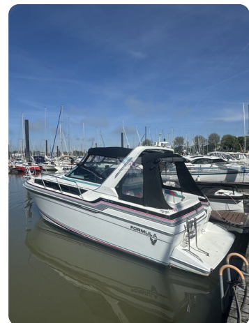
Formula BALU 33