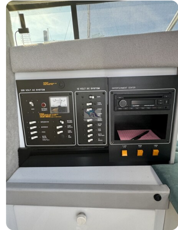
Formula BALU 52