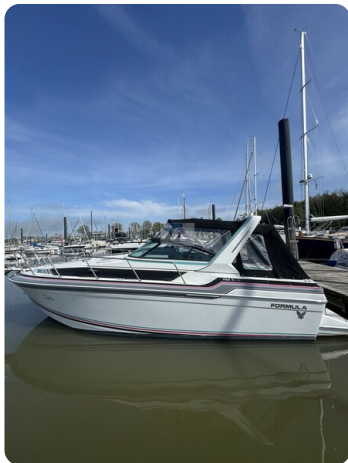
Formula BALU 74