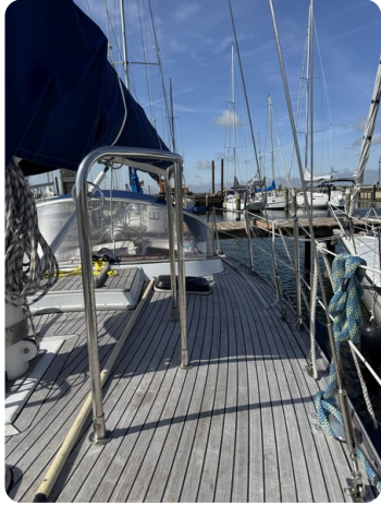
Phantom 35 TOWANDA 33