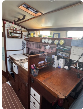
Phantom 35 TOWANDA 61