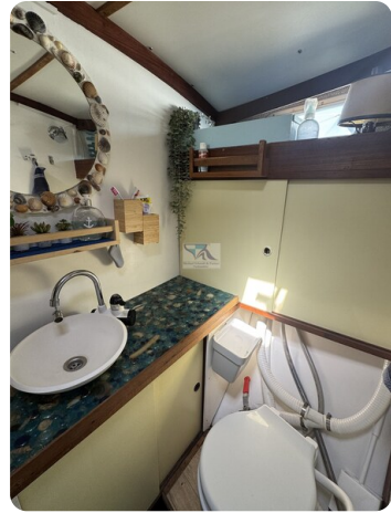
Phantom 35 TOWANDA 65