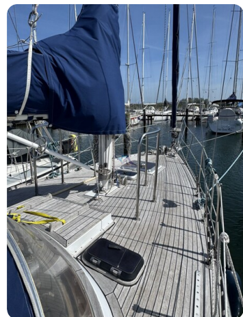
Phantom 35 TOWANDA 23