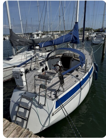
Phantom 35 TOWANDA 104