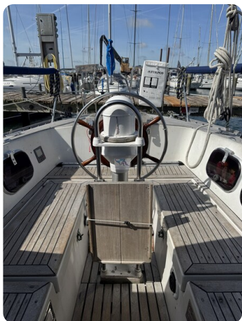
Phantom 35 TOWANDA 12