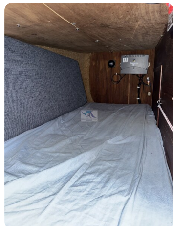
Phantom 35 TOWANDA 51