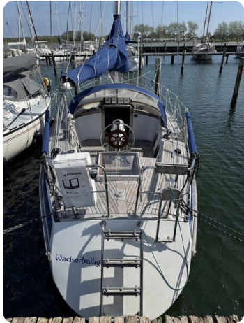
Phantom 35 TOWANDA 103