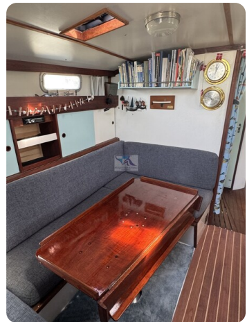
Phantom 35 TOWANDA 60