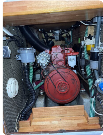
Phantom 35 TOWANDA 80