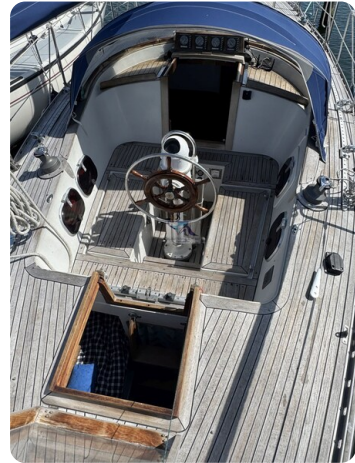
Phantom 35 TOWANDA 18