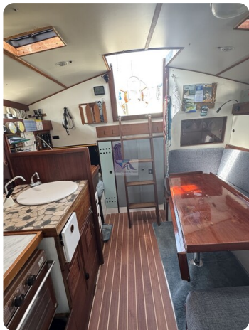
Phantom 35 TOWANDA 48