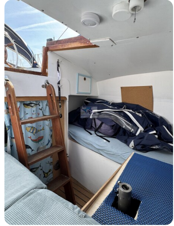
Phantom 35 TOWANDA 10