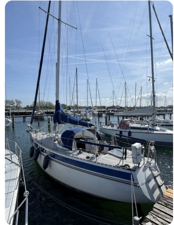
Phantom 35 TOWANDA 108