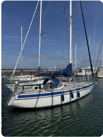
Phantom 35 TOWANDA 105