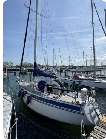
Phantom 35 TOWANDA 108