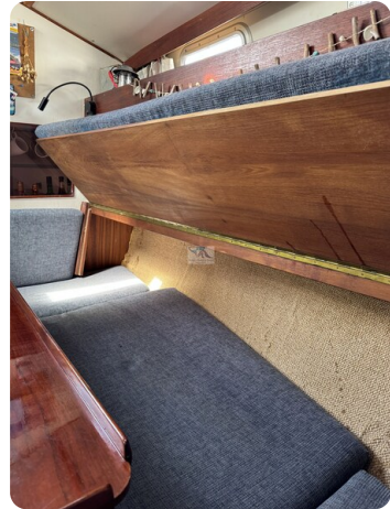
Phantom 35 TOWANDA 75