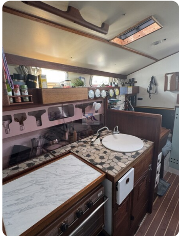
Phantom 35 TOWANDA 49