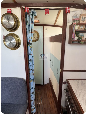
Phantom 35 TOWANDA 64