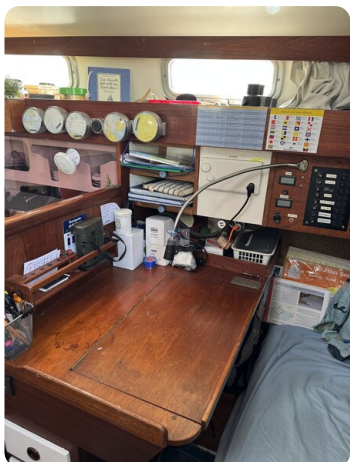
Phantom 35 TOWANDA 50