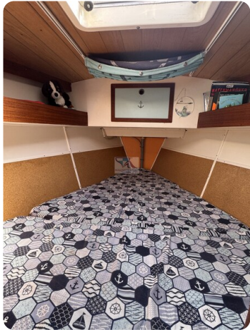
Phantom 35 TOWANDA 70