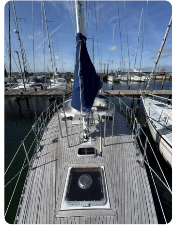
Phantom 35 TOWANDA 31