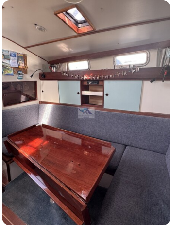
Phantom 35 TOWANDA 47