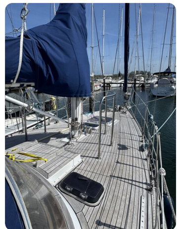
Phantom 35 TOWANDA 23