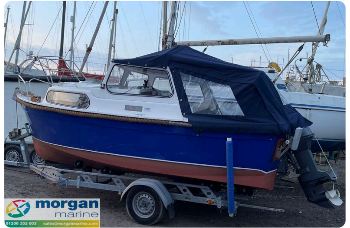
Hardy PH 17 - back canopy