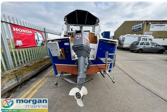
Hardy PH 17 - engine