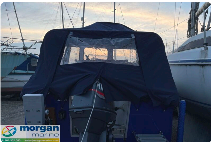
Hardy PH 17 - back canopy 2