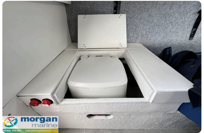
Hardy PH 17 - toilet