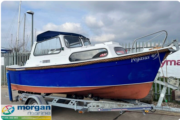
Hardy PH 17 - Main