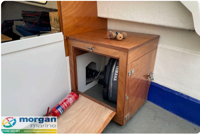
Hardy PH 17 - aux engine