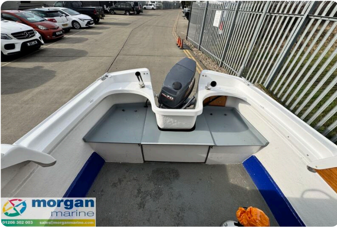
Hardy PH 17 - back bench