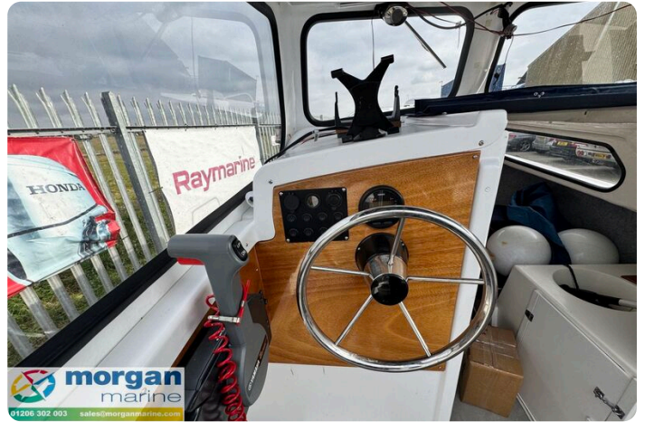
Hardy PH 17 - wheel