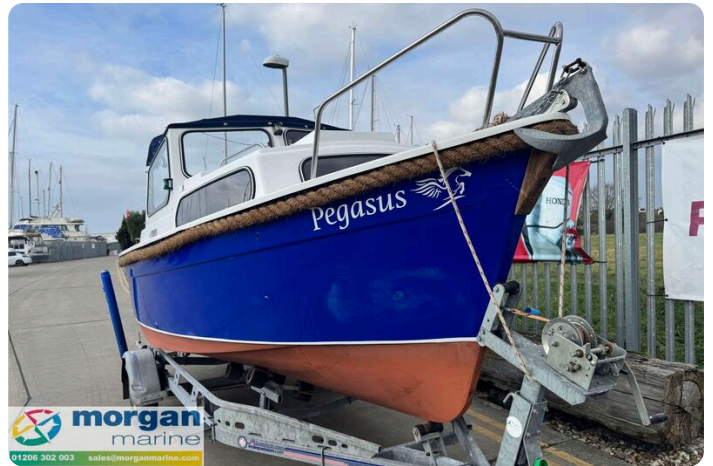
Hardy PH 17 - bow