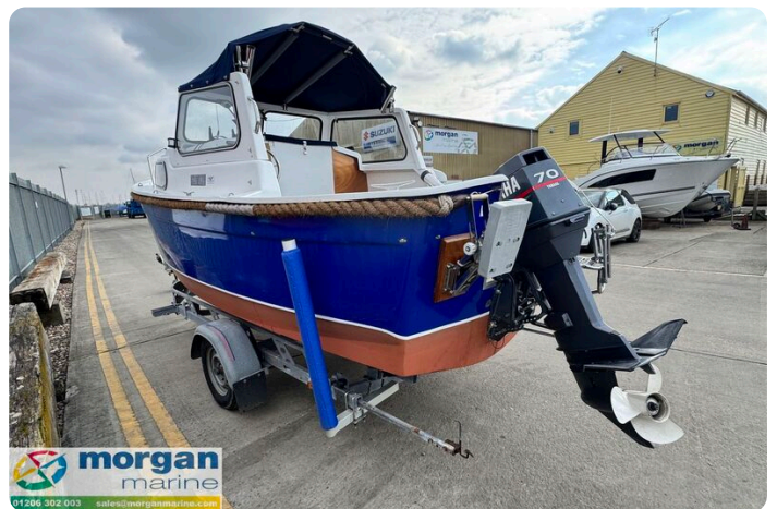
Hardy PH 17 - engine