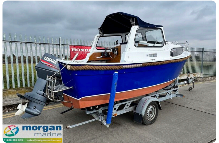
Hardy PH 17 - back