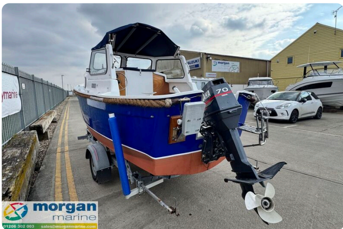
Hardy PH 17 - engine back