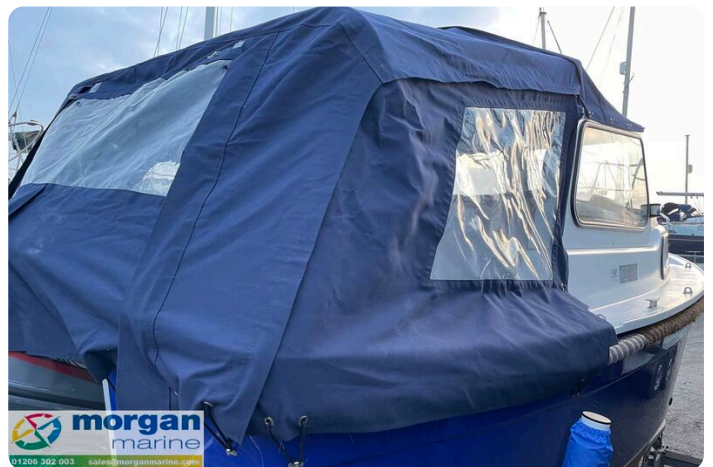
Hardy PH 17 - canopy on