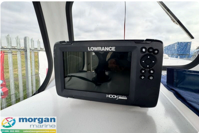
Hardy PH 17 - plotter