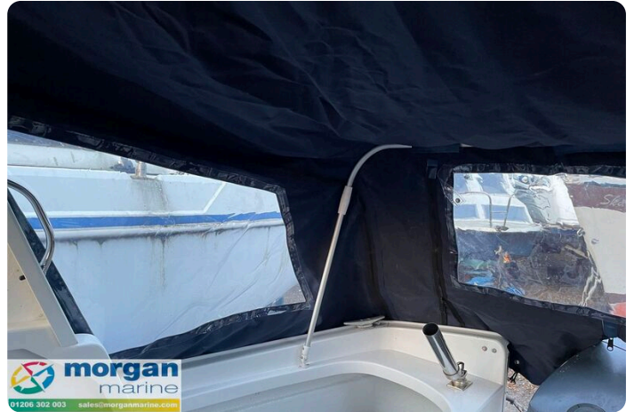
Hardy PH 17 - Canopy