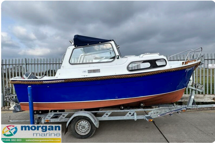
Hardy PH 17 - side view