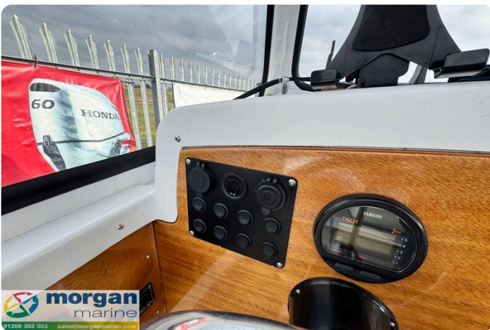
Hardy PH 17 - gauge