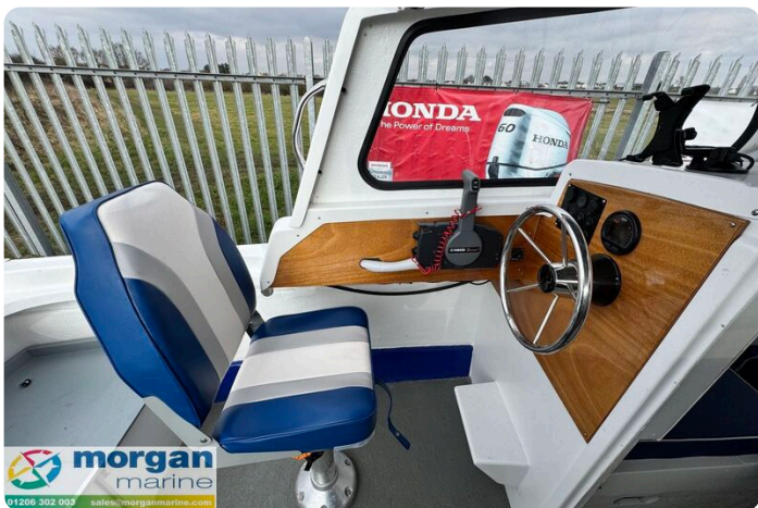
Hardy PH 17 - pilot