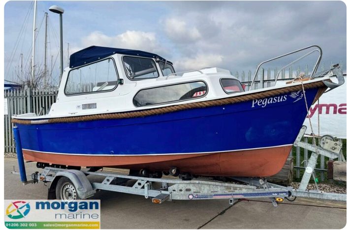
Hardy PH 17 - side view