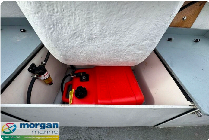
Hardy PH 17 - fuel tank