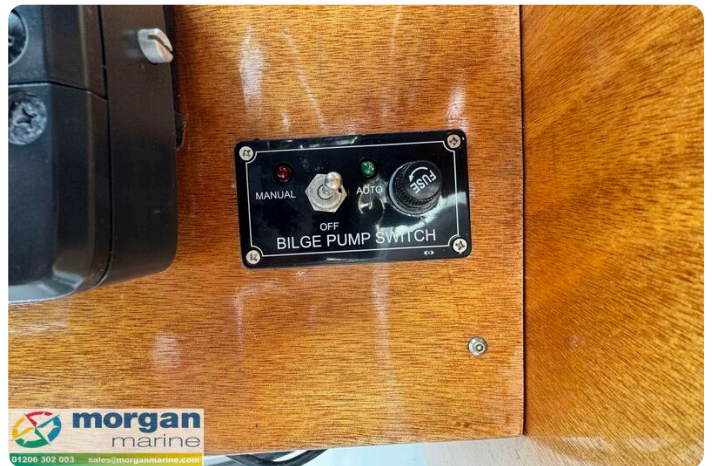
Hardy PH 17 - bilge