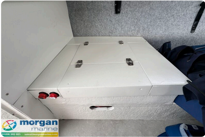
Hardy PH 17 - Switch