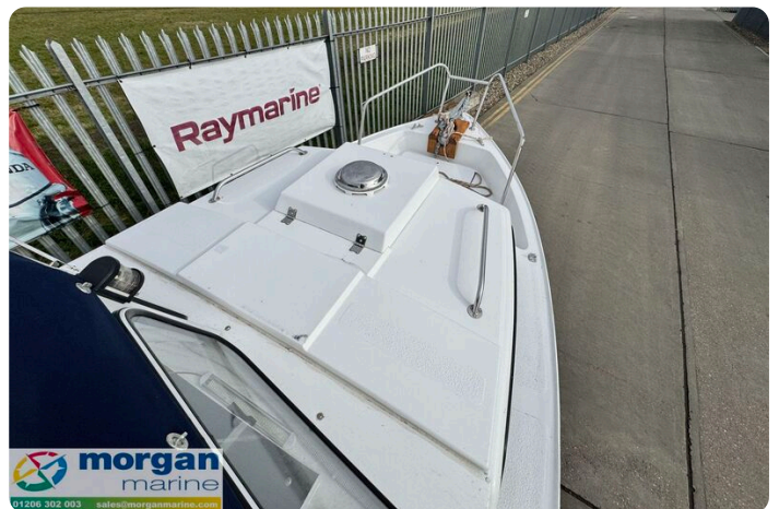
Hardy PH 17 - bow