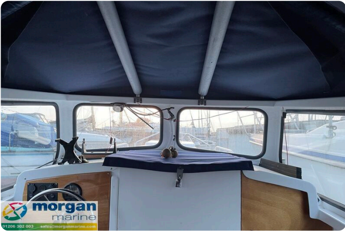
Hardy PH 17 - door