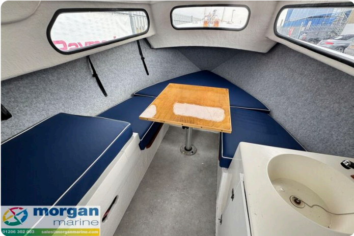
Hardy PH 17 - saloon table