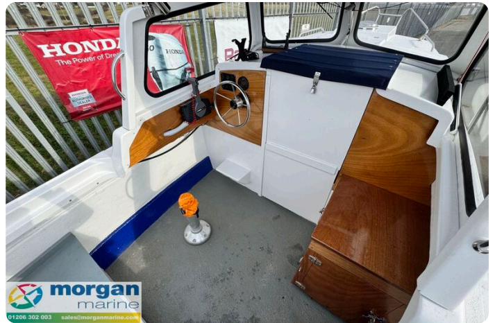
Hardy PH 17 -cockpit