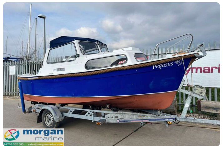
Hardy PH 17 - side