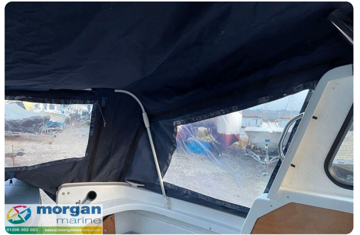
Hardy PH 17 - window