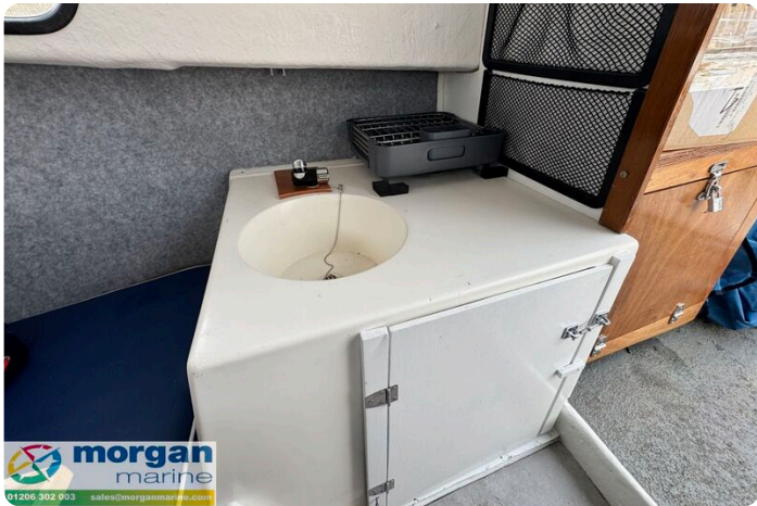
Hardy PH 17 - sink