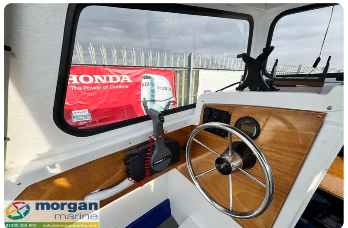
Hardy PH 17 - wheel