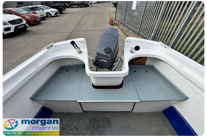
Hardy PH 17 - bench