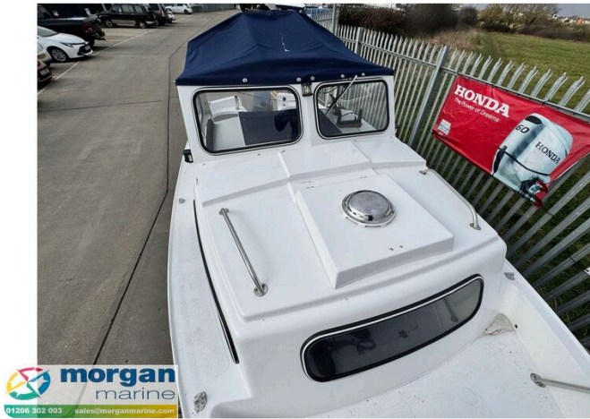
Hardy PH 17 - bow hatch