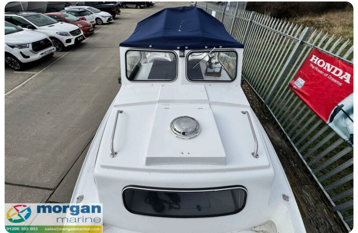
Hardy PH 17 - hatch