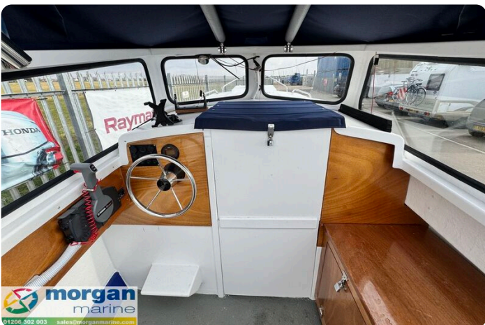
Hardy PH 17 - cockpit