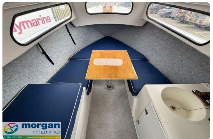
Hardy PH 17 - saloon