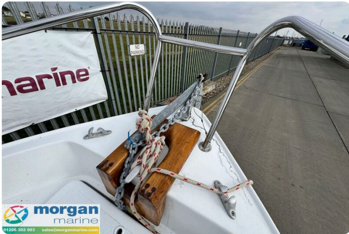
Hardy PH 17 - anchor