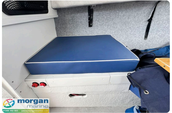
Hardy PH 17 - seating