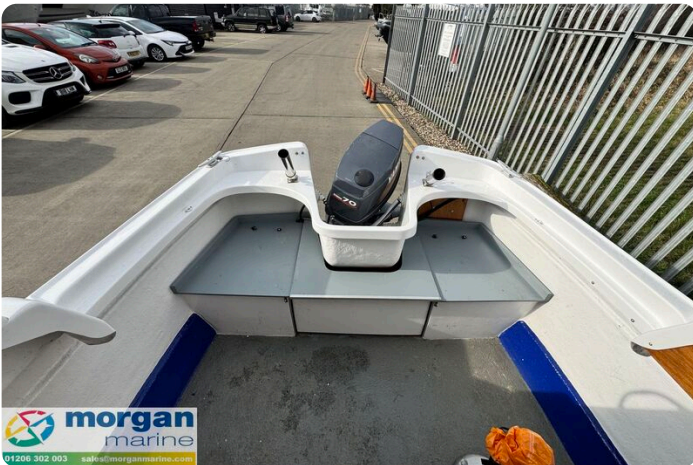
Hardy PH 17 - back bench