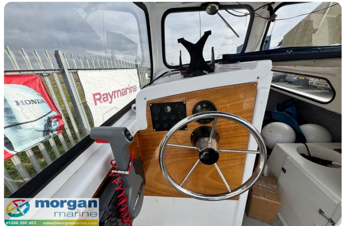
Hardy PH 17 - wheel