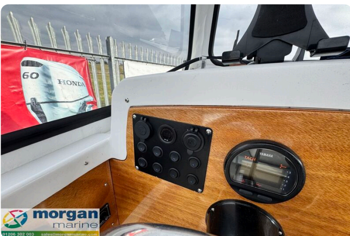
Hardy PH 17 - gauge