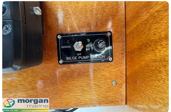
Hardy PH 17 - bilge