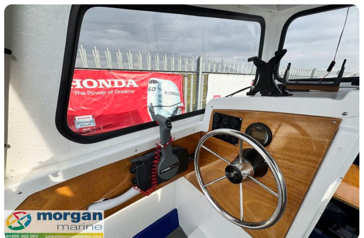
Hardy PH 17 - wheel