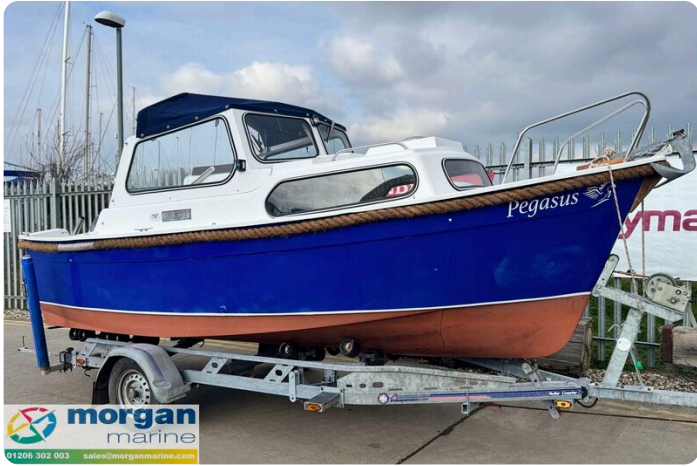
Hardy PH 17 - side view