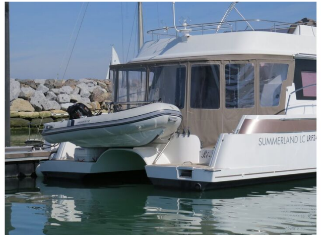
Highfield CL 290 aluminium hull RIB - tender on larger boat