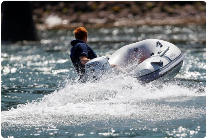
Highfield CL 290 aluminium hull RIB - transom on the water