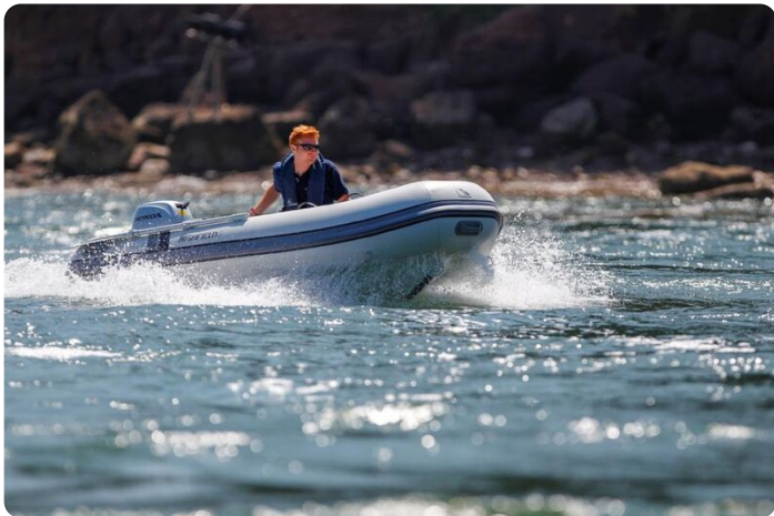
Highfield CL 290 aluminium hull RIB - starboard side bow