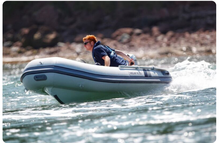
Highfield CL 290 aluminium hull RIB - port side bow