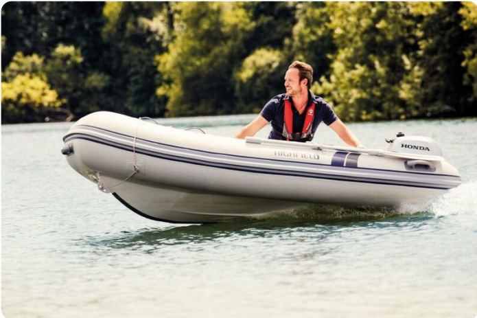
Highfield CL 310 - on the water