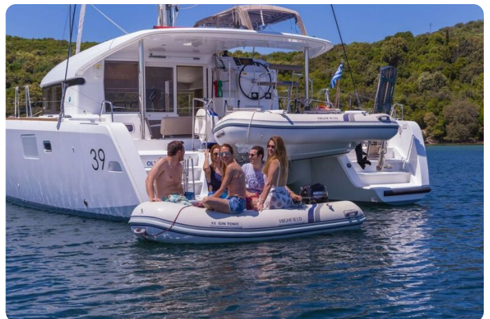
Highfield CL 310 aluminium RIB - tender to larger boat