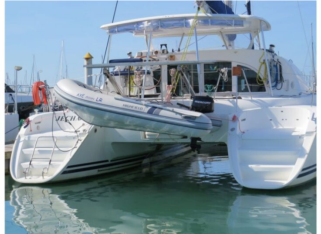
Highfield CL 310 - lifted into water