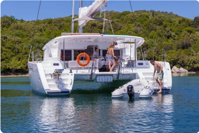
Highfield CL 310 - lifted off larger boat