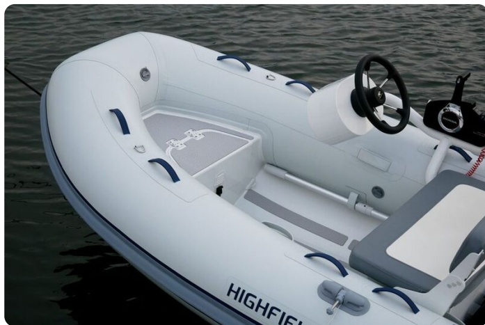
Highfield CL 340 aluminium RIB - bow