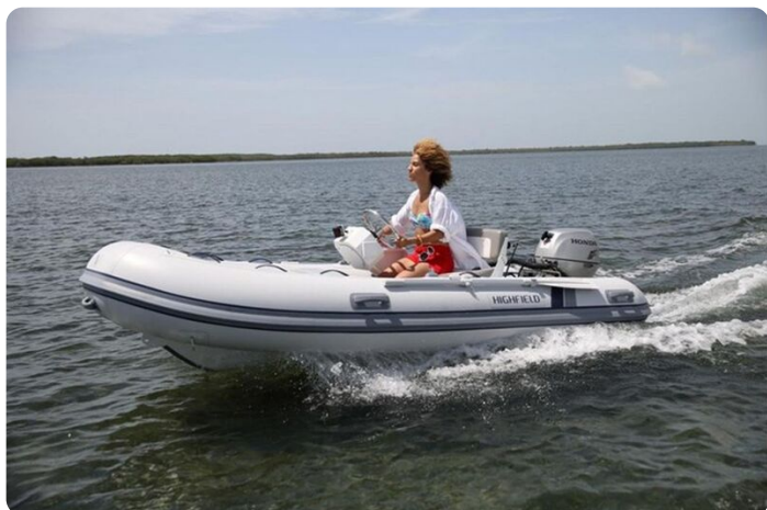
Highfield CL 260 aluminium RIB - on the water