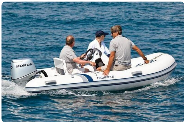
Highfield CL 260 aluminium RIB