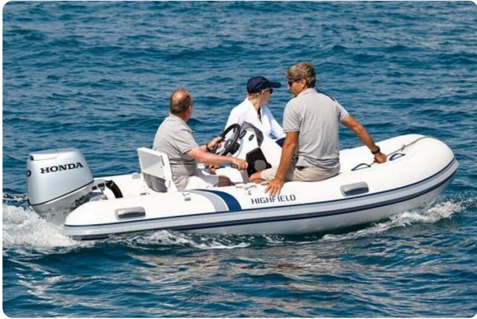
Highfield CL 260 aluminium RIB