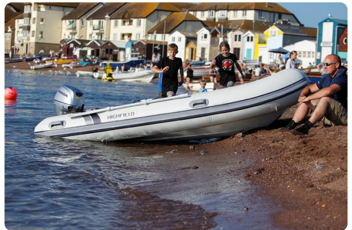
Highfield CL 360 aluminium RIB - port side