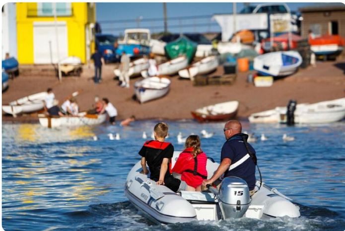
Highfield CL 360 aluminium RIB - and other RIBs on the water