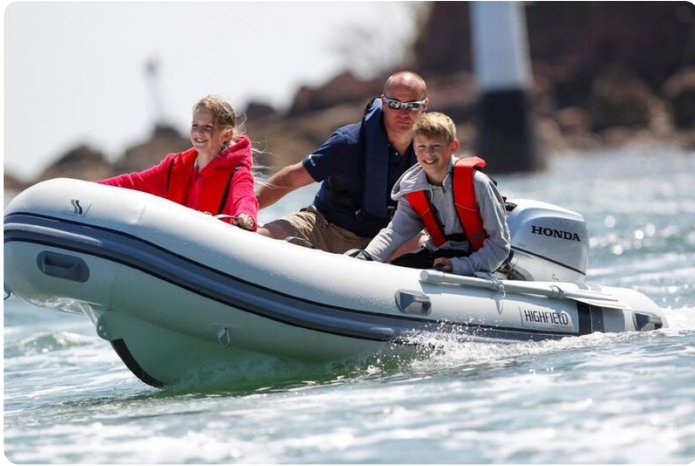
Highfield CL 360 aluminium RIB