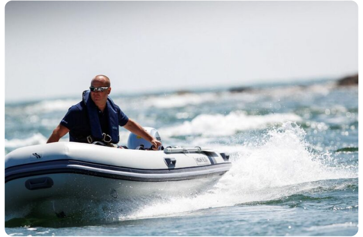
Highfield CL 360 aluminium RIB - view towards bow