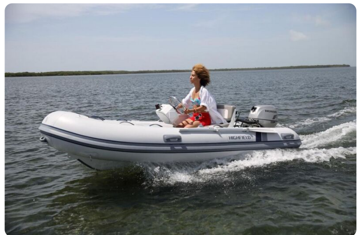
Highfield CL 360 aluminium RIB - on the water