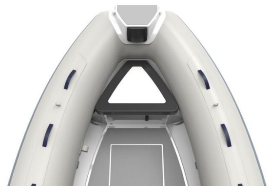
Highfield Classic 420 aluminium RIB - bow