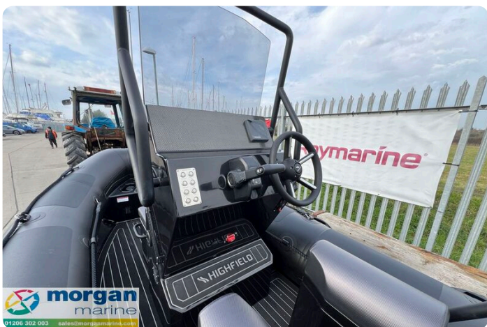
Highfield Patrol 460 black - dash