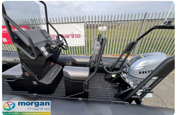
Highfield Patrol 460 black - jockey seats