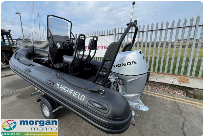
Highfield Patrol 460 black - A frame