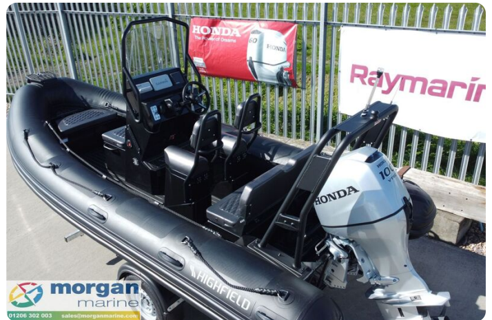
Highfield Patrol 500 aluminium RIB - overhead view of console