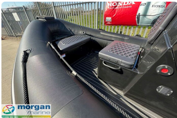
Highfield Patrol 500 aluminium RIB - bow seating