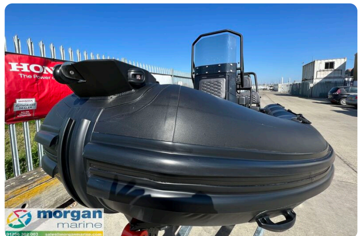
Highfield Patrol 500 aluminium RIB - bow and tubes