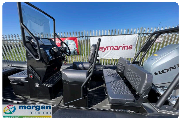
Highfield Patrol 500 aluminium RIB - jockey seats and aft bench seat