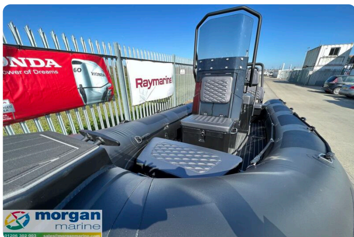
Highfield Patrol 500 aluminium RIB - tubes and bow seating