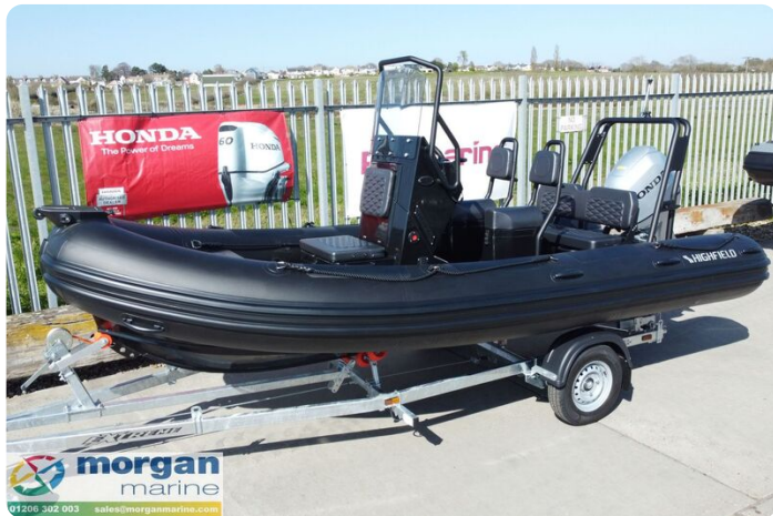
Highfield Patrol 500 aluminium RIB