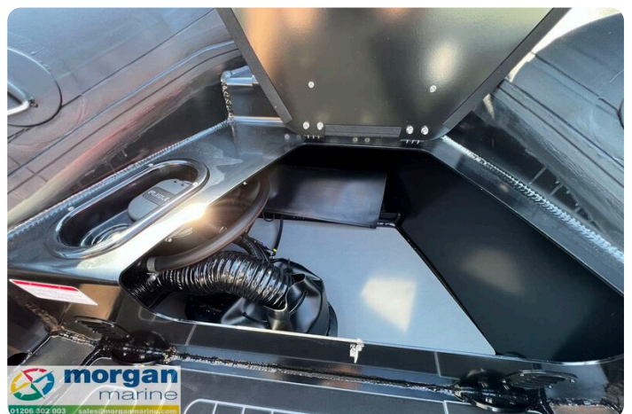
Highfield Patrol 500 aluminium RIB - bow locker