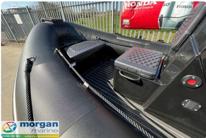
Highfield Patrol 500 aluminium RIB - bow seating