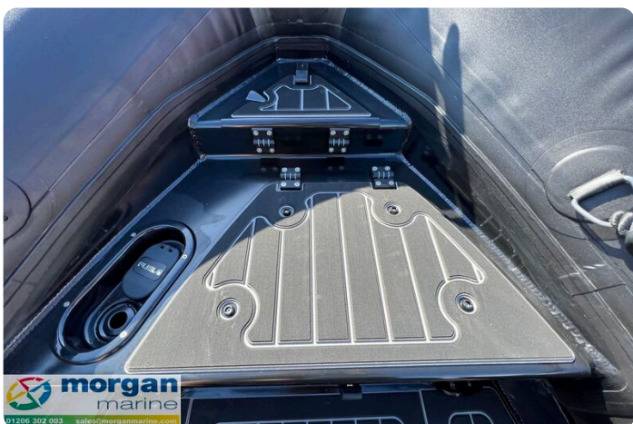
Highfield Patrol 500 aluminium RIB - bow cushion