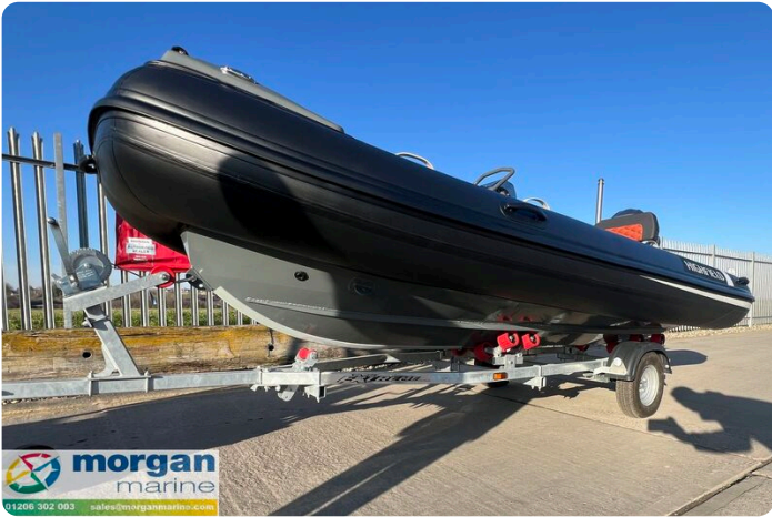
Highfield Sport 420 - hull bottom