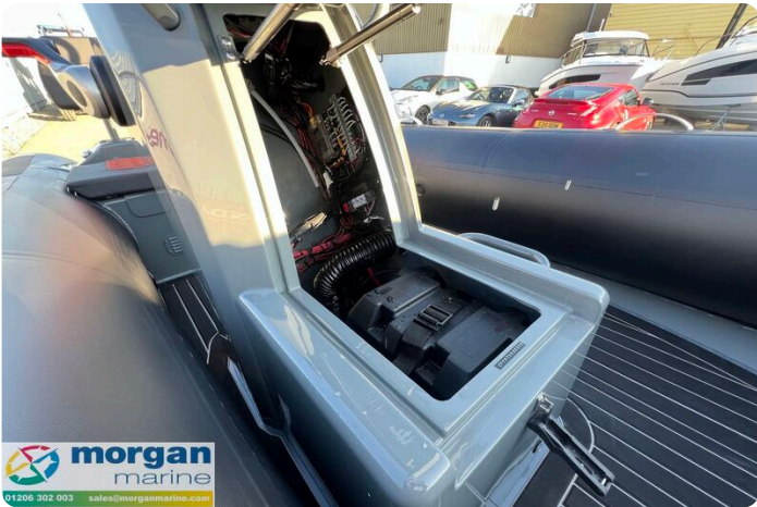
Highfield Sport 420 - console locker