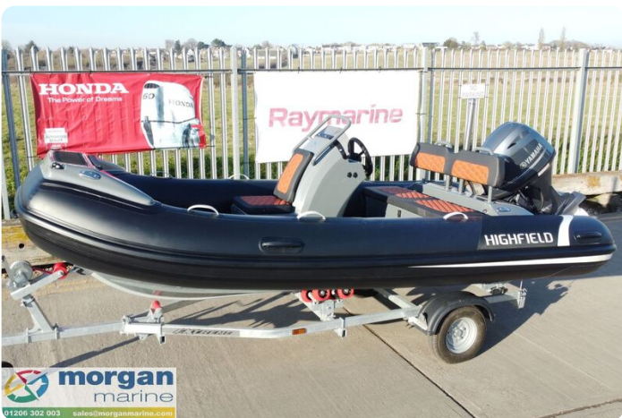
Highfield Sport 420 - Side