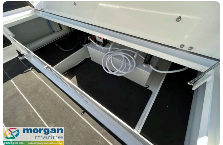
Highfield Sport 700 - storage compartment