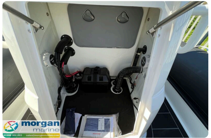
Highfield Sport 700 - battery compartment