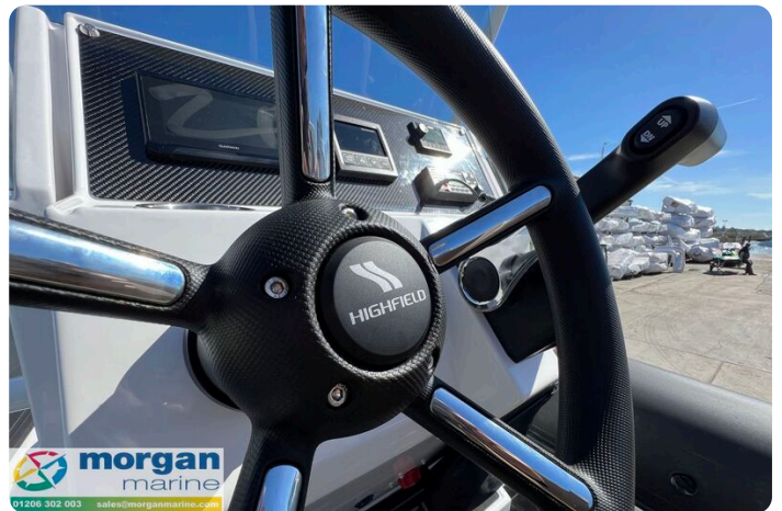
Highfield Sport 700 - steering wheel and dash