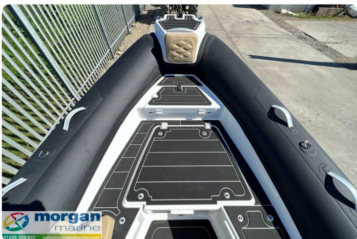
Highfield Sport 700 - bow locker closed