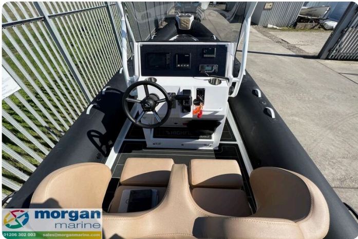
Highfield Sport 700 - console and seating