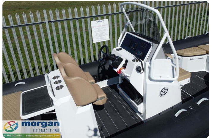
Highfield Sport 700 - helm position