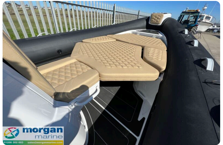
Highfield Sport 700 - bow cushions and forward console seat - with infill