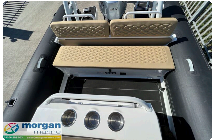
Highfield Sport 700 - seating and drinks holders