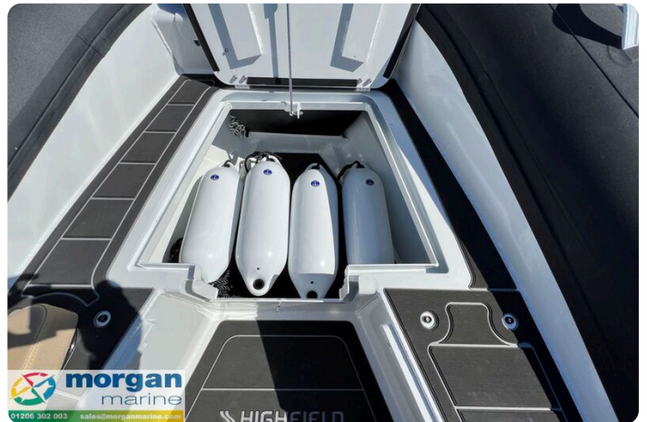
Highfield Sport 700 - bow locker with fenders in