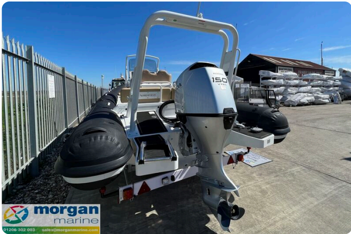
Highfield Sport 700 - port side of engine