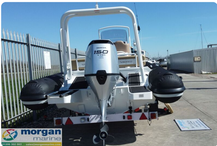
Highfield Sport 700 - transom and engine