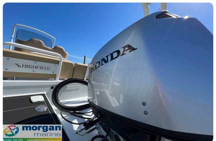
Highfield Sport 700 - Honda engine cowl