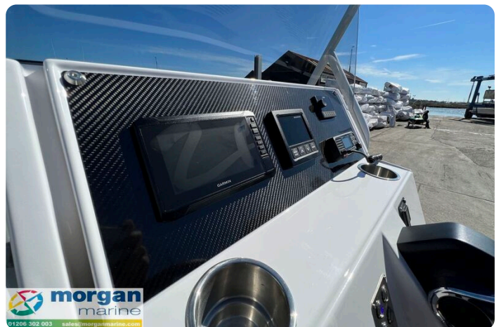
Highfield Sport 700 - display screens