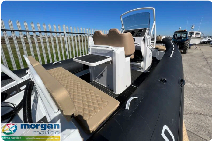
Highfield Sport 700 - starboard side tubes