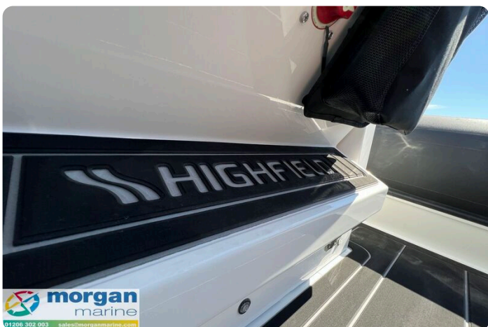
Highfield Sport 700 - decals