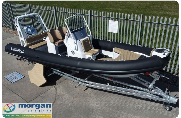
Highfield Sport 700 - overhead view from starboard side