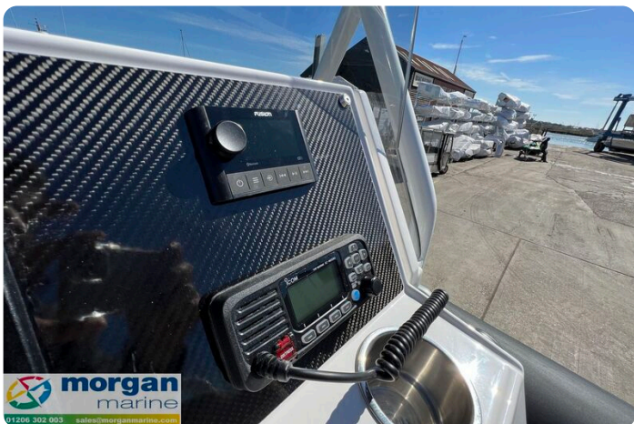
Highfield Sport 700 - VHF radio