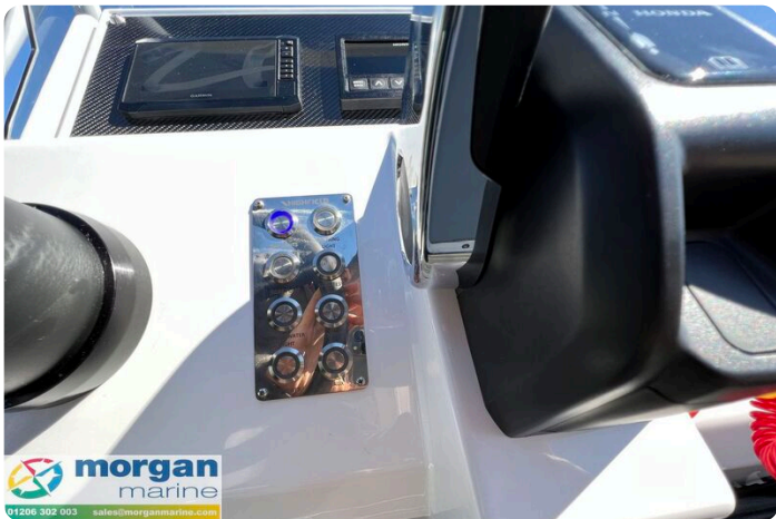
Highfield Sport 700 - switch panel