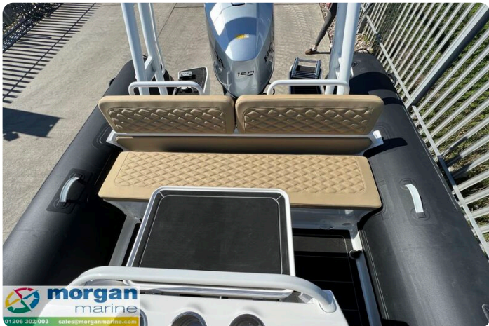
Highfield Sport 700 - folding table for aft bench