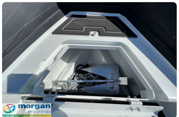
Highfield Sport 700 - anchor locker