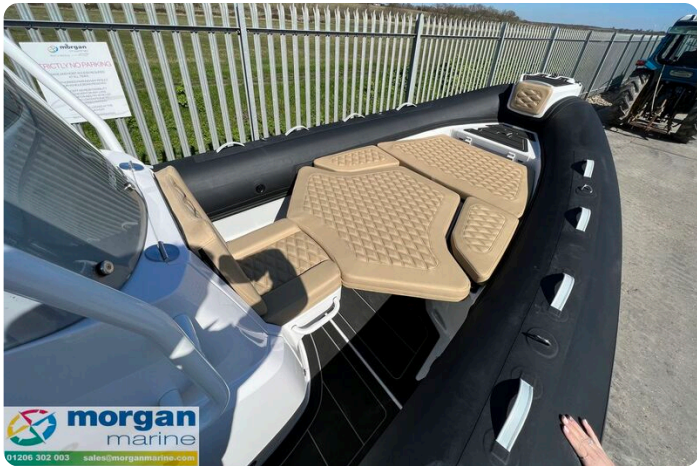
Highfield Sport 700 - bow cushions with sun lounger infill