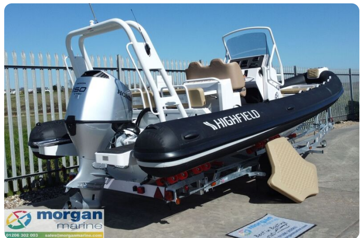
Highfield Sport 700 - A-frame