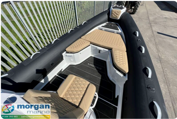
Highfield Sport 700 - bow cushions and forward console seat - without infill