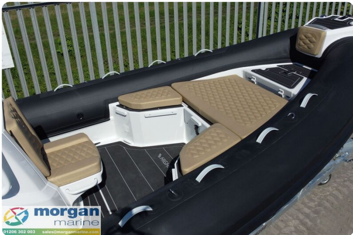
Highfield Sport 700 - bow cushions without sunlounger infill