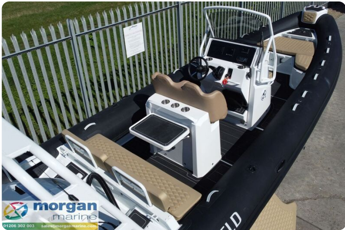
Highfield Sport 700 - seating