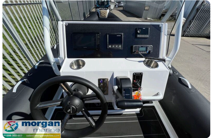
Highfield Sport 700 - engine controls