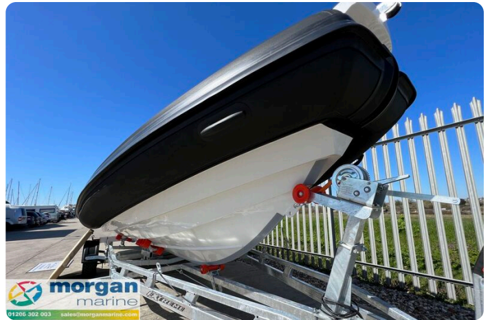
Highfield Sport 700 - bow