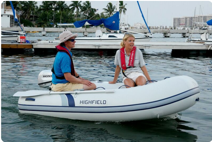
Highfield UL 260 aluminium-RIB - tender to larger boat