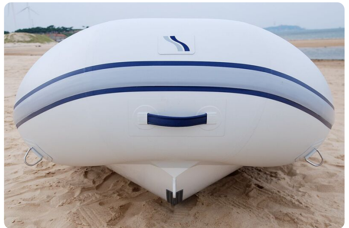
Highfield UL 260 aluminium-RIB - bow