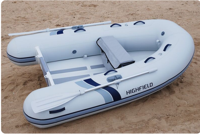
Highfield UL 260 aluminium-RIB