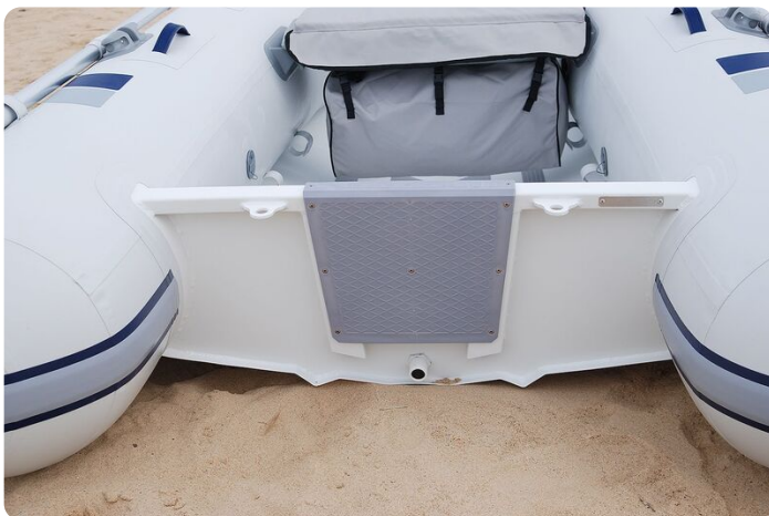
Highfield UL 260 aluminium-RIB - transom