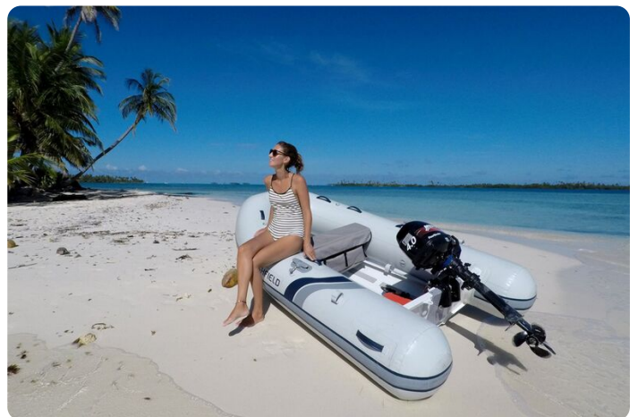
Highfield UL 260 aluminium-RIB - on the water