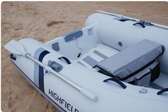
Highfield UL 260 aluminium-RIB - bench seat