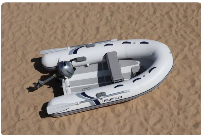
Highfield UL 290 aluminium-RIB - on a beach