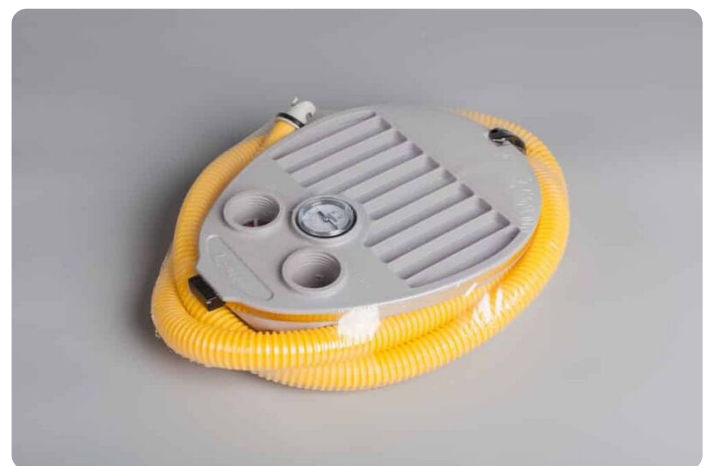
Highfield UL 340 aluminium-RIB - pump