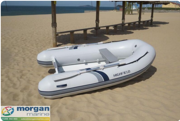
Highfield UL 340 aluminium RIB