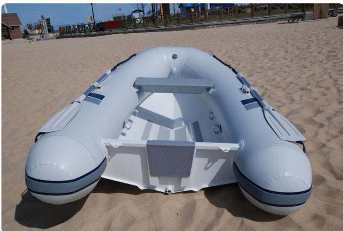
Highfield UL 340 aluminium-RIB - overhead view