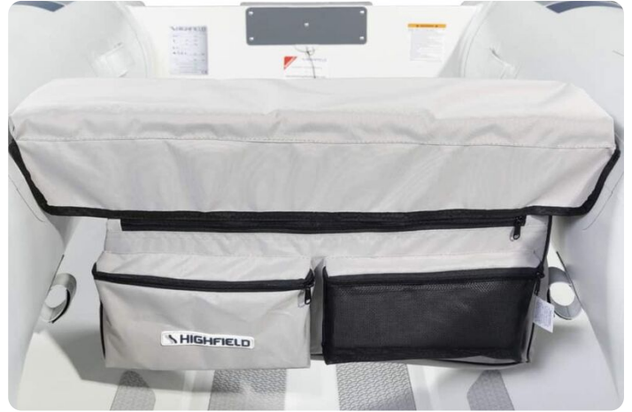
Highfield UL 340 aluminium-RIB - storage