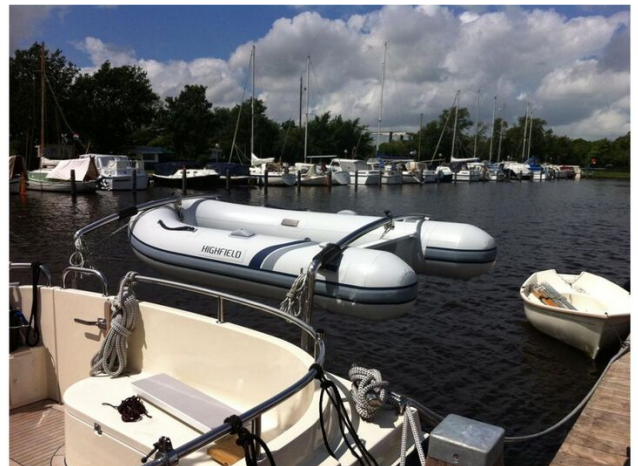
Highfield UL 340 aluminium-RIB - on a larger boat