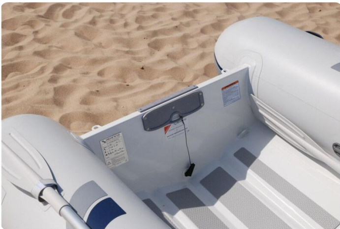
Highfield UL 340 aluminium-RIB - deck and transom