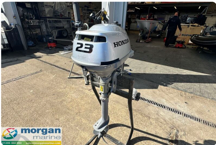
Honda BF2.3 Short Shaft - Main