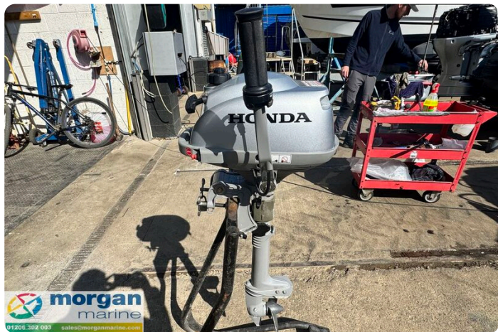
Honda BF2.3 Short Shaft - tiller