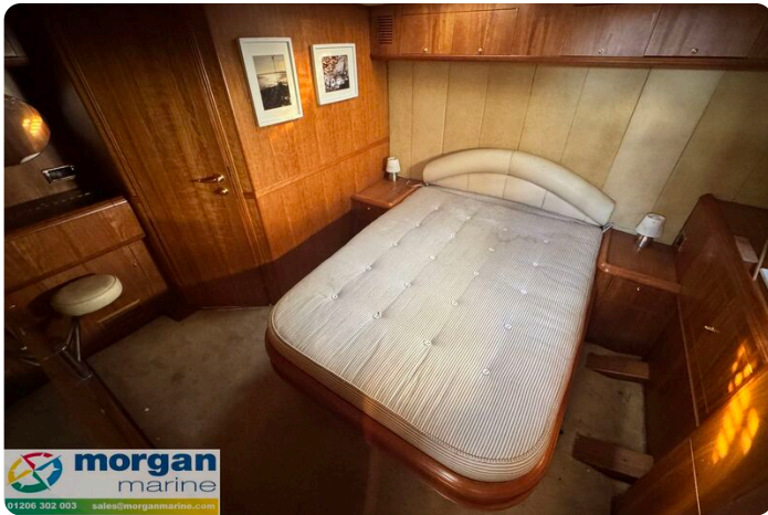
Humber 42 TSDY - AFT Berth