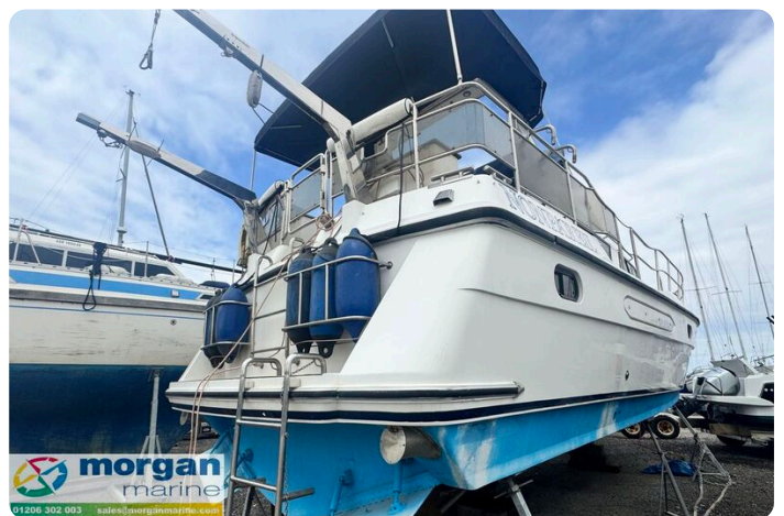
Humber 42 - ladder