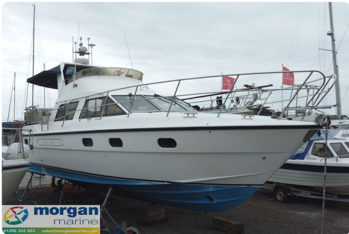
Humber 42 - side view