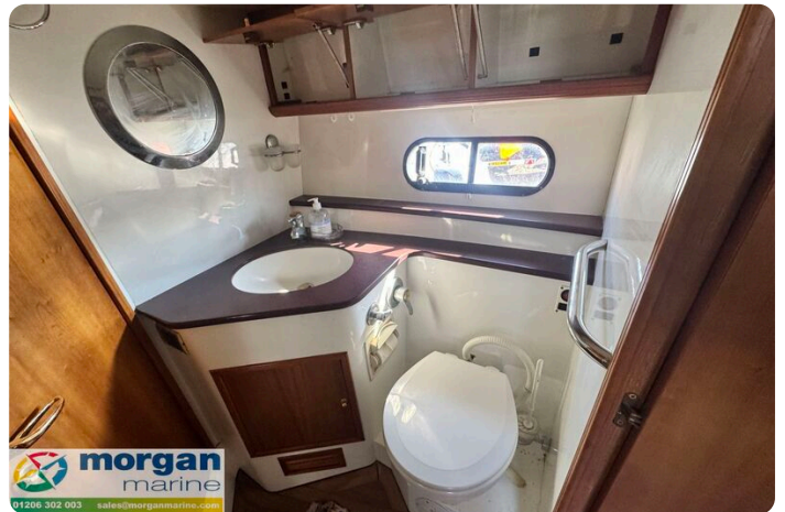
Humber 42 TSDY - toilet 1