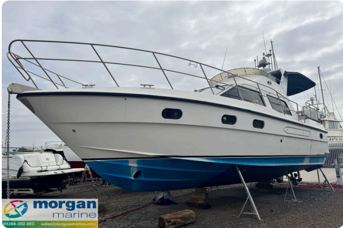
Humber 42 - Main