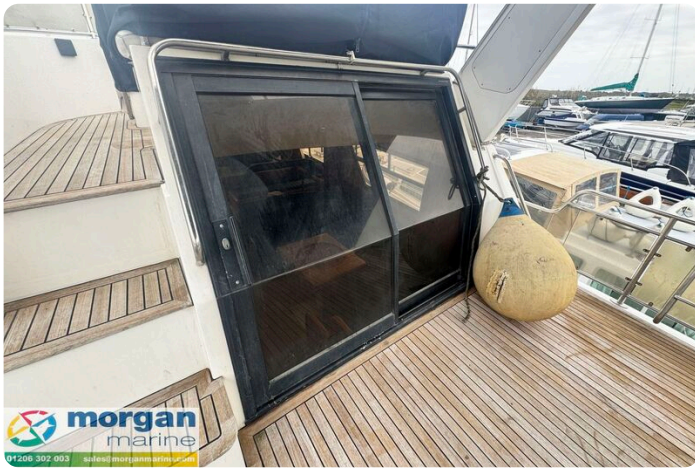
Humber 42 - doors