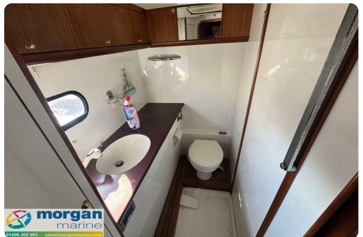
Humber 42 TSDY - aft toilet