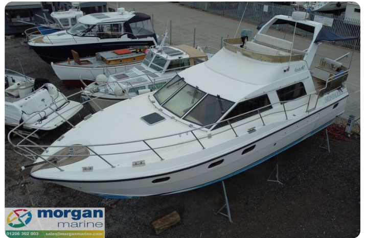
Humber 42 - side view