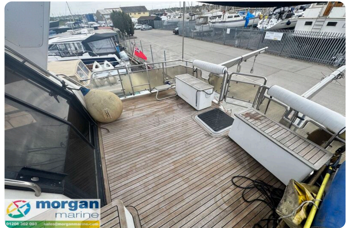
Humber 42 - deck