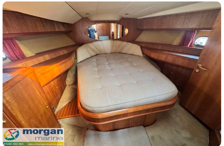
Humber 42 TSDY - main berth