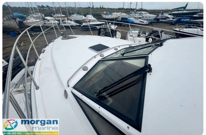
Humber 42 - windscreen