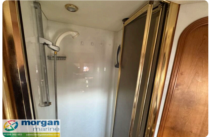
Humber 42 TSDY - shower