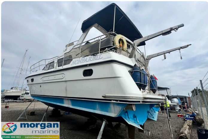
Humber 42 - back