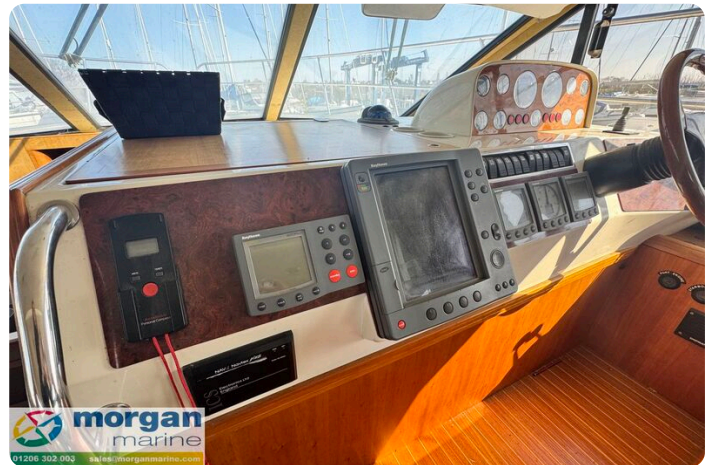
Humber 42 TSDY - plotter