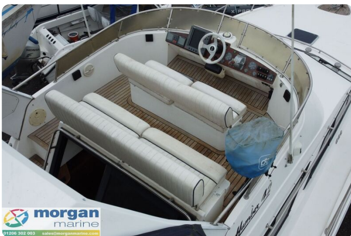
Humber 42 - fly seating