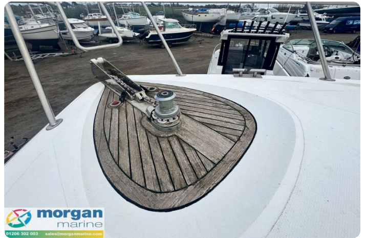
Humber 42 - anchor