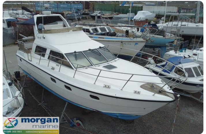
Humber 42 - top view