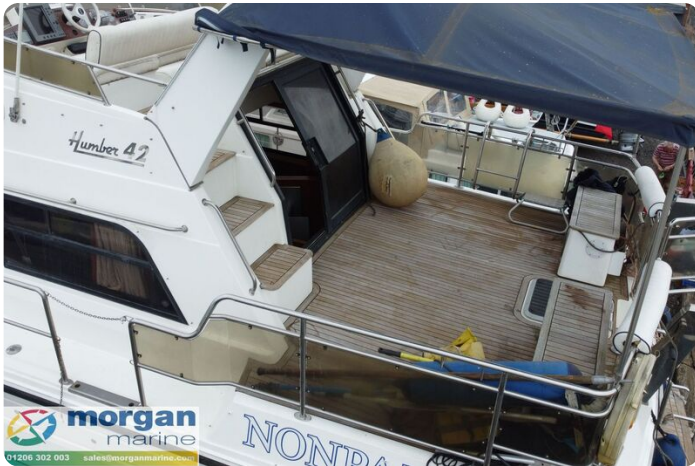
Humber 42 - fenders