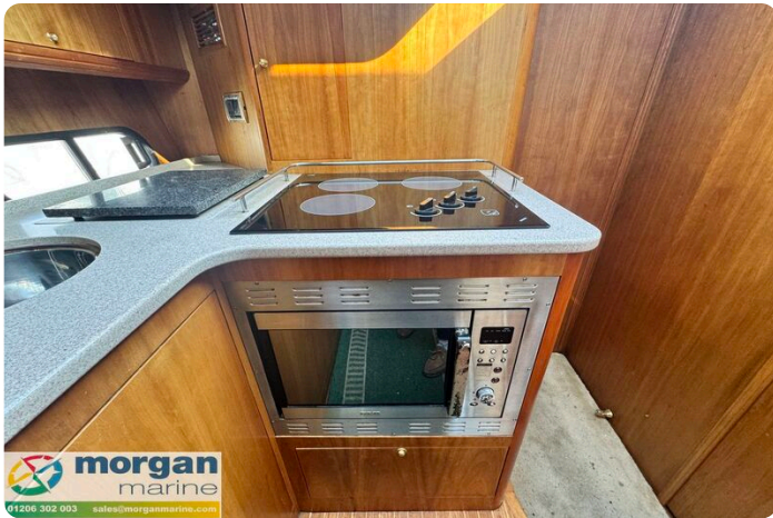
Humber 42 TSDY - cooker