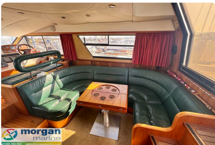
Humber 42 TSDY - Saloon