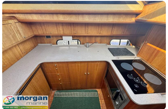
Humber 42 TSDY - galley