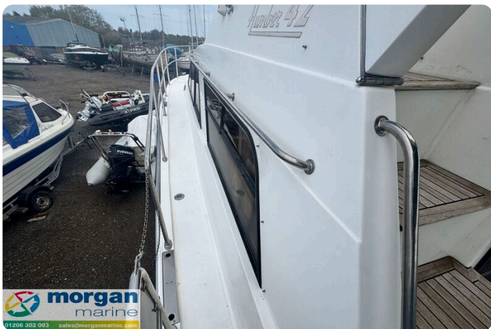
Humber 42 - walk way