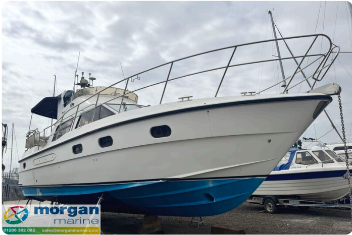
Humber 42 - railings