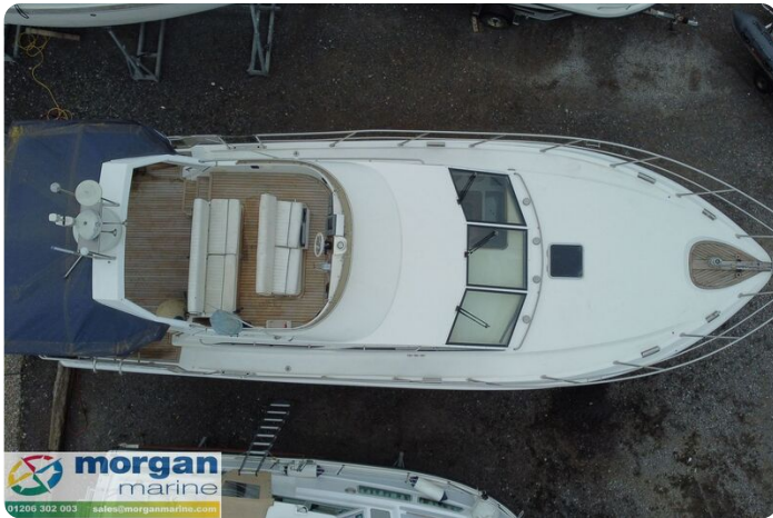
Humber 42 - top view