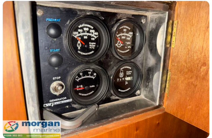
Humber 42 - gauges