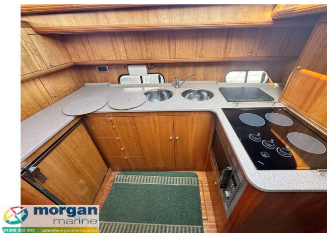
Humber 42 TSDY - sink