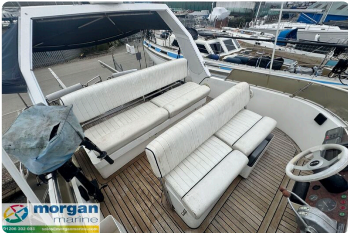
Humber 42 - flybridge