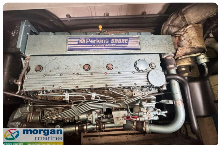
Humber 42 - close up engines