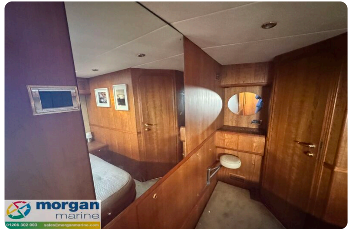
Humber 42 TSDY - aft mirror