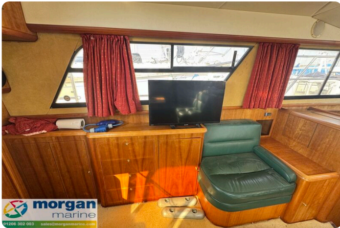
Humber 42 TSDY - TV