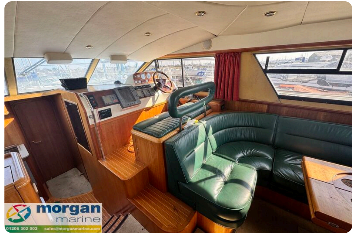
Humber 42 TSDY - Saloon 2