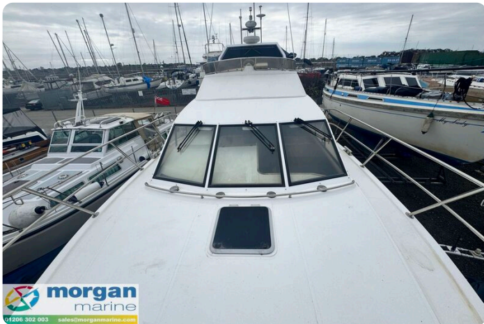
Humber 42 - wipers