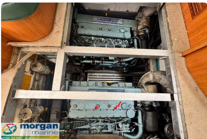
Humber 42 - engines