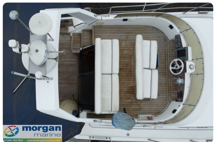
Humber 42 - seating