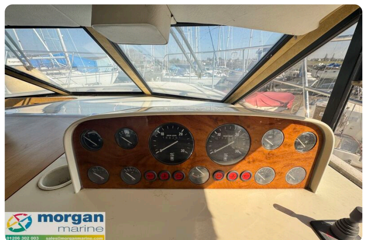
Humber 42 TSDY - dash