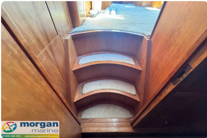
Humber 42 TSDY - steps up