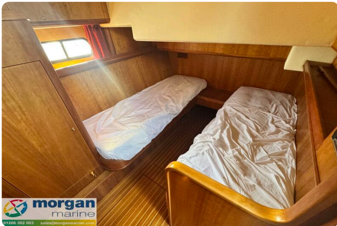
Humber 42 TSDY - twin berths