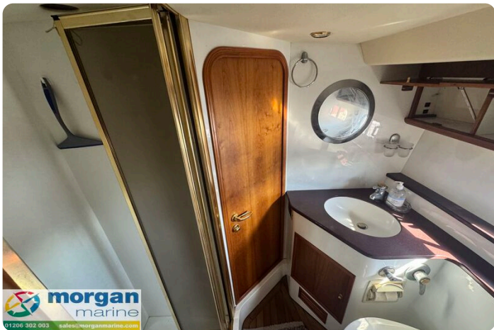
Humber 42 TSDY - sink