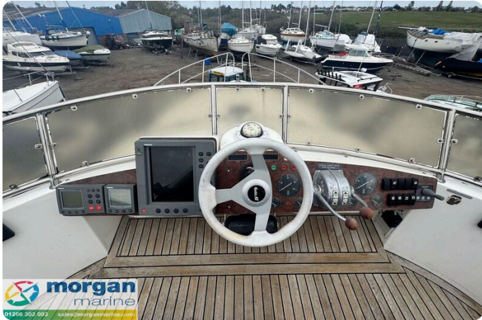
Humber 42 - fly wheel