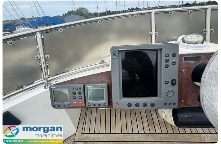
Humber 42 - fly plotter