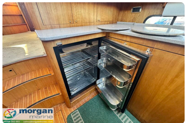
Humber 42 TSDY - fridge