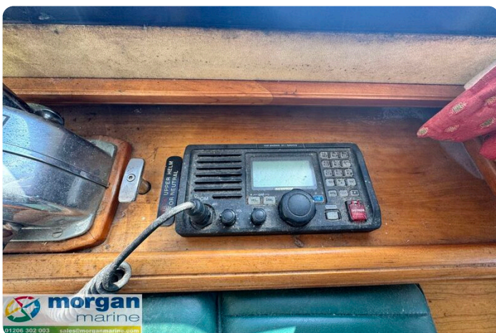
Humber 42 TSDY - plotter