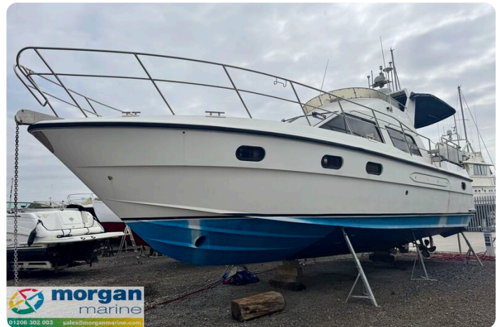
Humber 42 - side