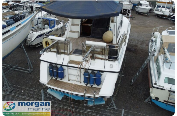
Humber 42 - back view