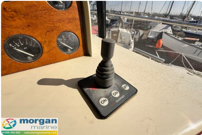
Humber 42 TSDY - bow thruster