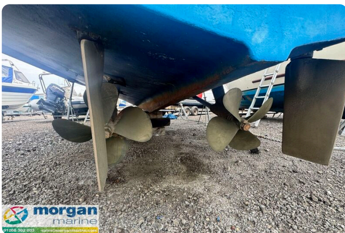
Humber 42 - props