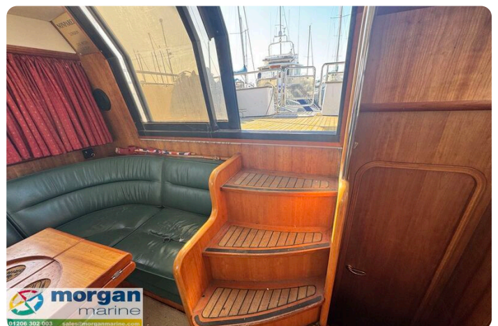
Humber 42 TSDY - saloon stairs