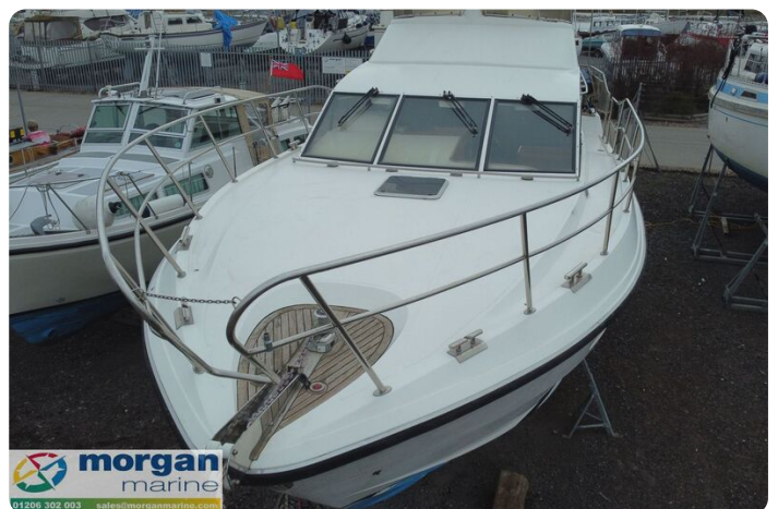
Humber 42 - bow