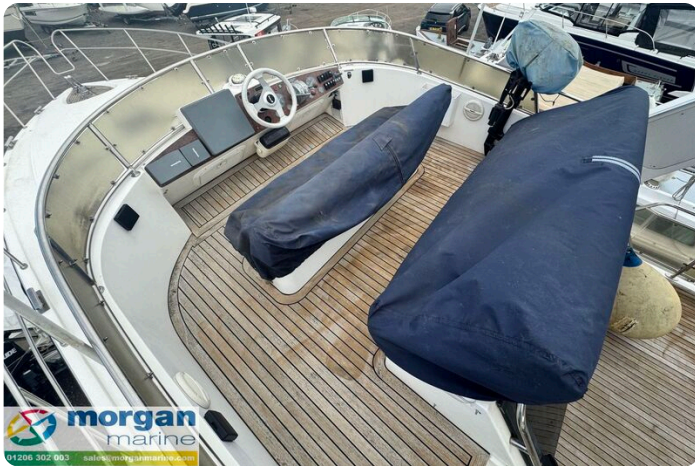
Humber 42 - fly covers