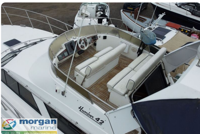
Humber 42 - pilot seat