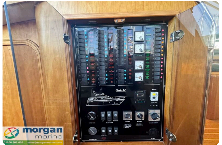
Humber 42 TSDY - isolators