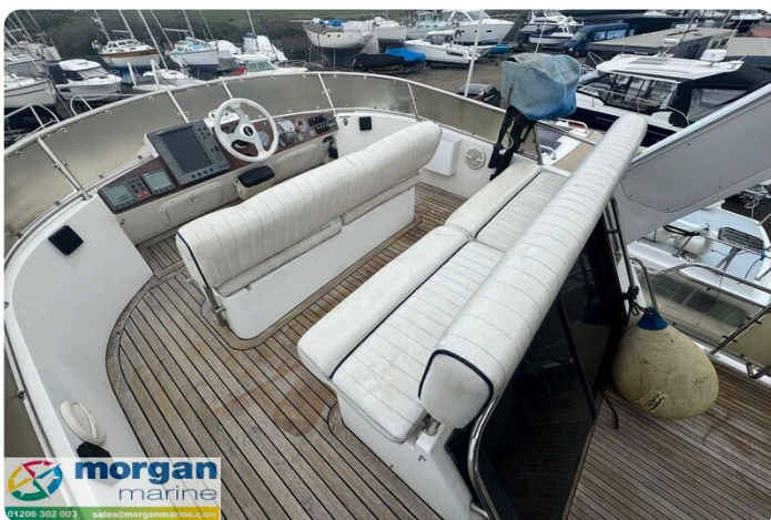
Humber 42 - fly