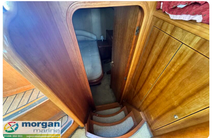
Humber 42 TSDY - steps down