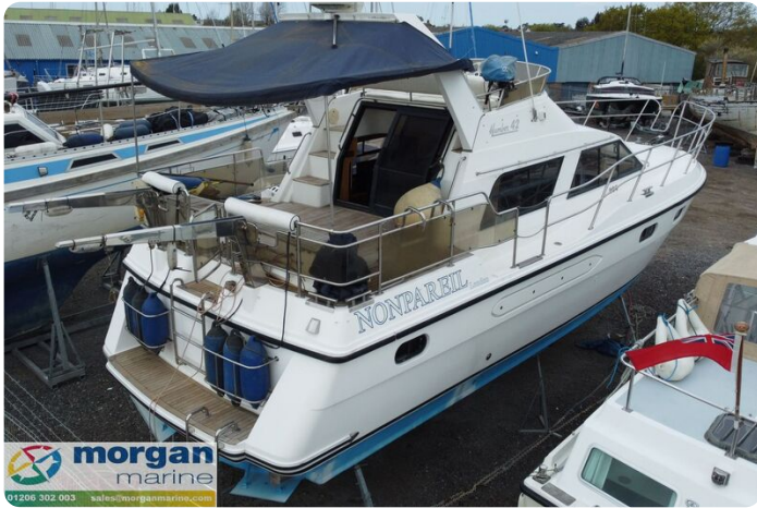
Humber 42 - fenders