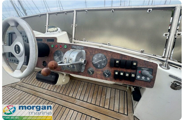
Humber 42 - fly controls