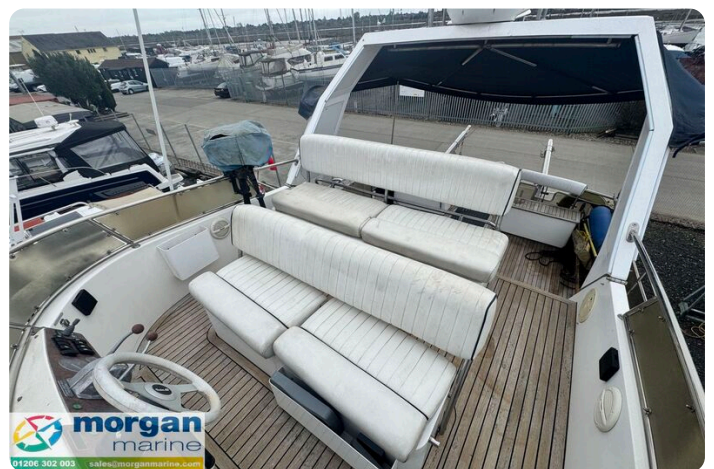
Humber 42 - fly seats