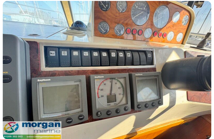
Humber 42 TSDY - controls