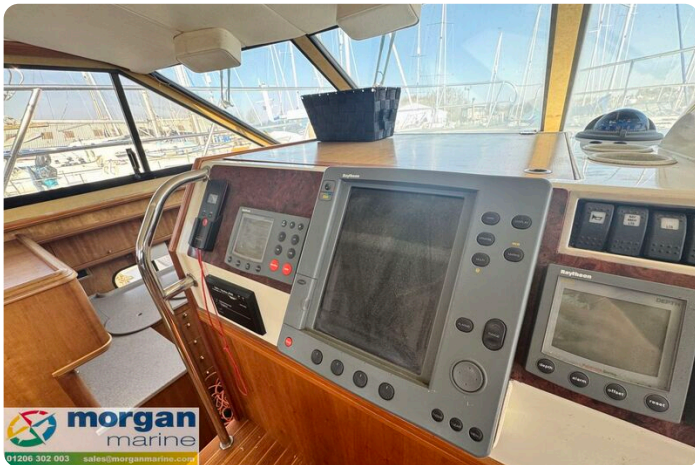
Humber 42 TSDY - plotter