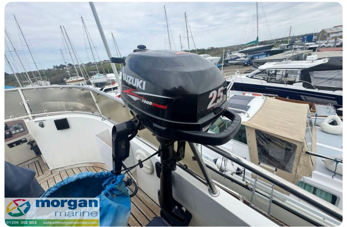
Humber 42 - aux