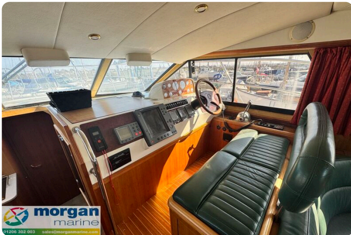
Humber 42 TSDY - pilot seat