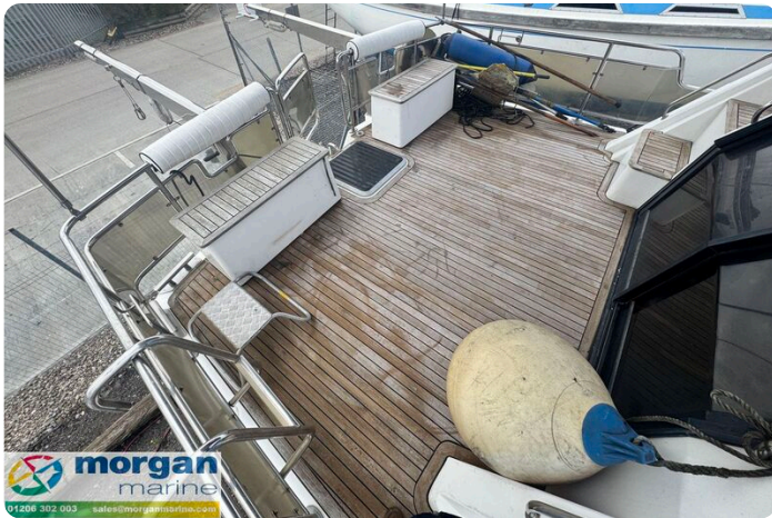
Humber 42 - decks