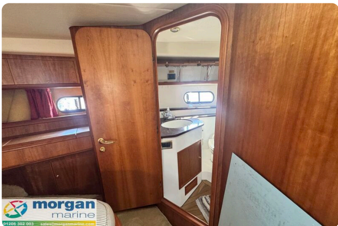
Humber 42 TSDY - door