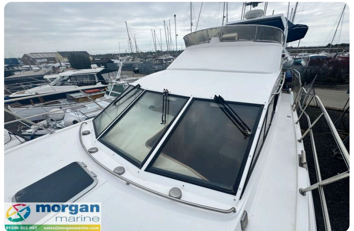
Humber 42 - wipers