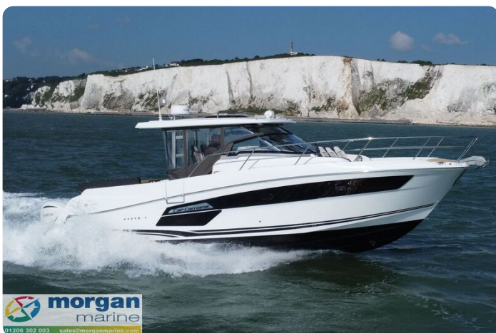
Jeanneau Cap Camarat 12.5 WA - starboard side