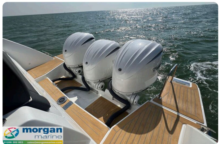
Jeanneau Cap Camarat 12.5 WA - triple Yamaha outboards from the swim platform