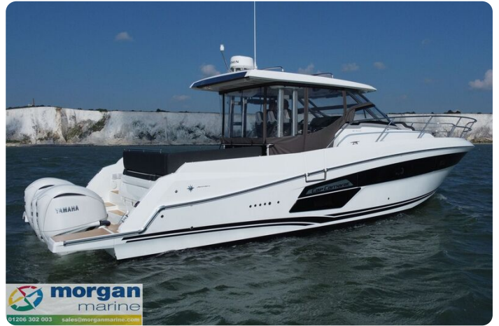
Jeanneau Cap Camarat 12.5 WA - starboard side from aft