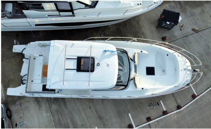
Jeanneau Cap Camarat 12.5 WA - overhead view