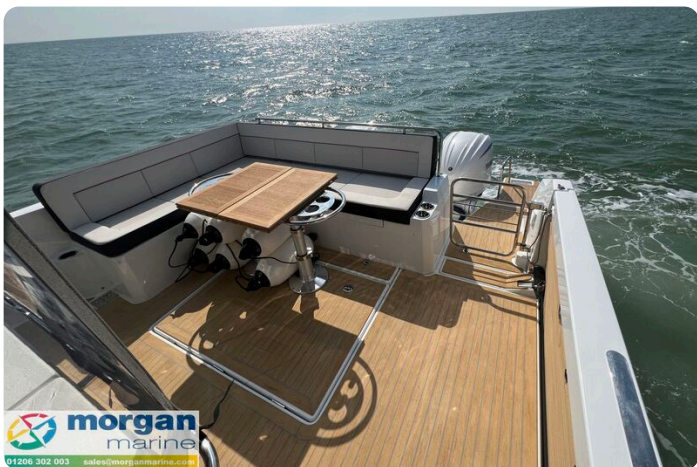
Jeanneau Cap Camarat 12.5 WA - cockpit