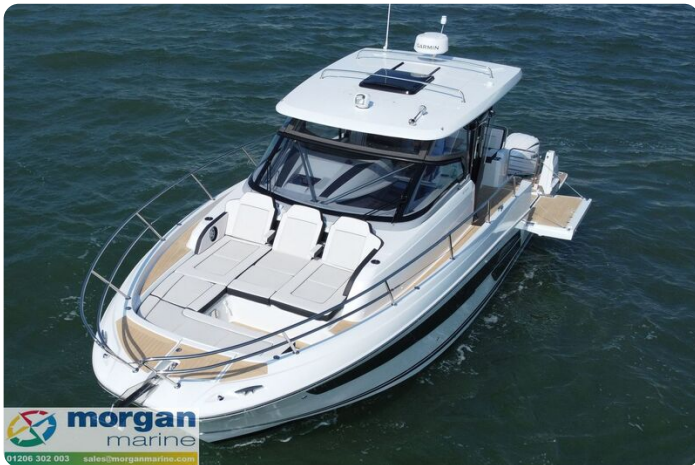
Jeanneau Cap Camarat 12.5 WA - bow seating