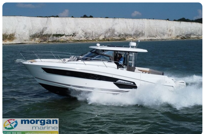
Jeanneau Cap Camarat 12.5 WA - moving through the water