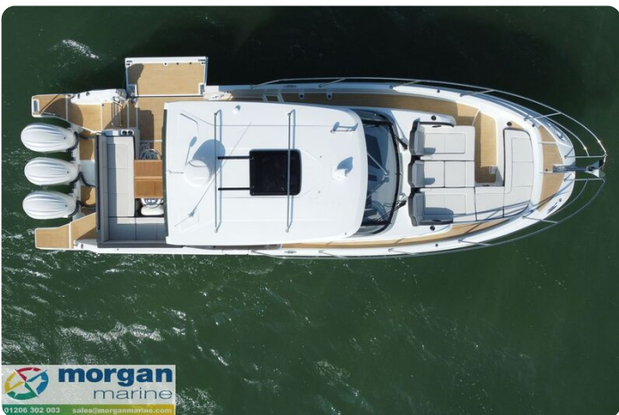
Jeanneau Cap Camarat 12.5 WA - overhead view of roof from port side