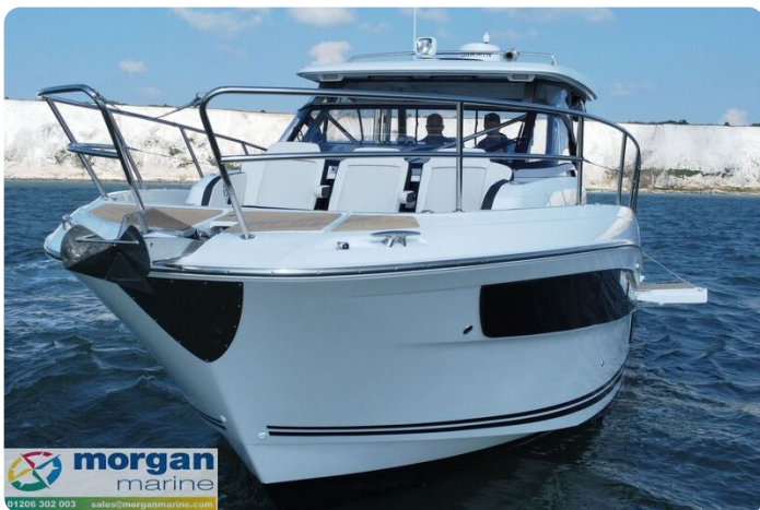
Jeanneau Cap Camarat 12.5 WA - bow seating