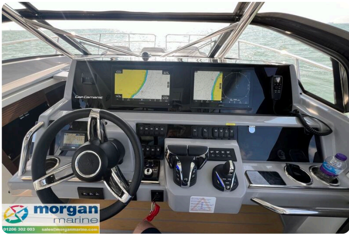
Jeanneau Cap Camarat 12.5 WA - full helm position