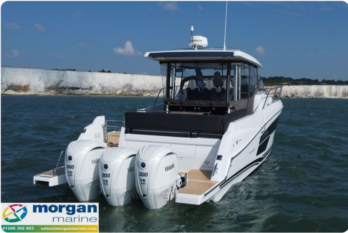
Jeanneau Cap Camarat 12.5 WA - transom from starboard side aft