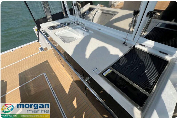
Jeanneau Cap Camarat 12.5 WA - cockpit galley