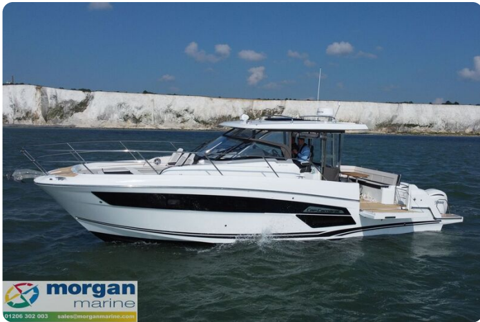
Jeanneau Cap Camarat 12.5 WA - port side with terrace open