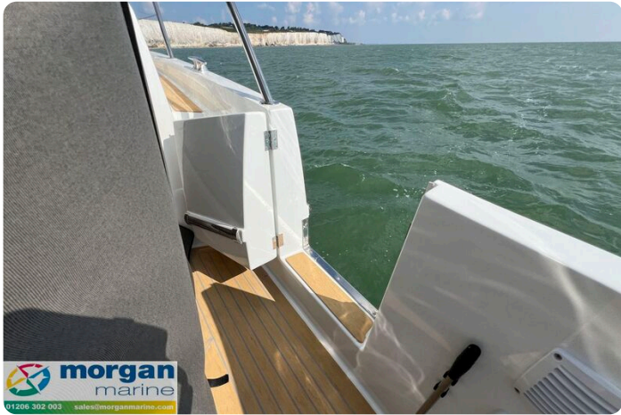
Jeanneau Cap Camarat 12.5 WA - starboard side cockpit gate for easy access to pontoons