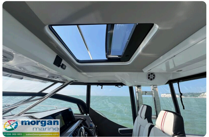
Jeanneau Cap Camarat 12.5 WA - hard top with electric sliding roof