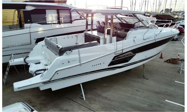
Jeanneau Cap Camarat 12.5 WA - starboard side