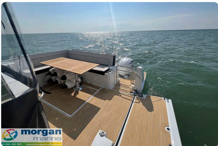
Jeanneau Cap Camarat 12.5 WA - inside cockpit with terrace open