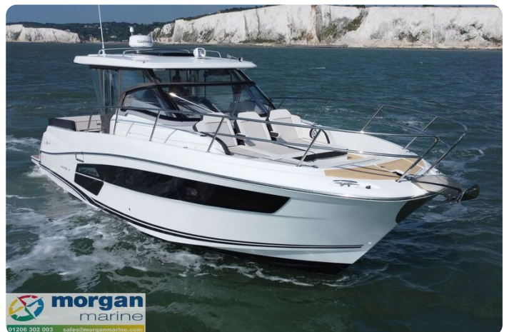
Jeanneau Cap Camarat 12.5 WA - starboard side bow