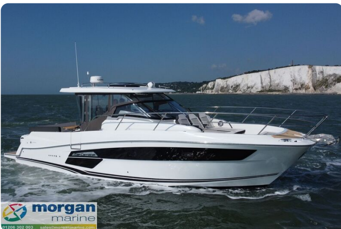
Jeanneau Cap Camarat 12.5 WA - bow from starboard side