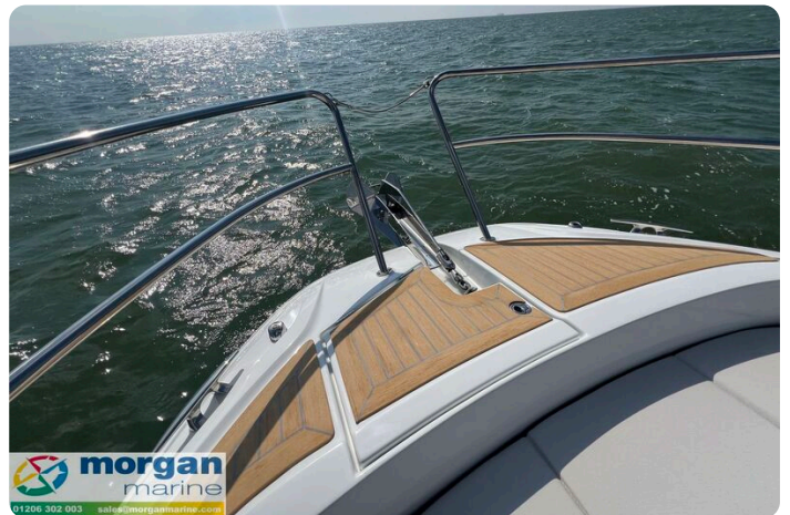
Jeanneau Cap Camarat 12.5 WA - anchor locker and pulpits rails