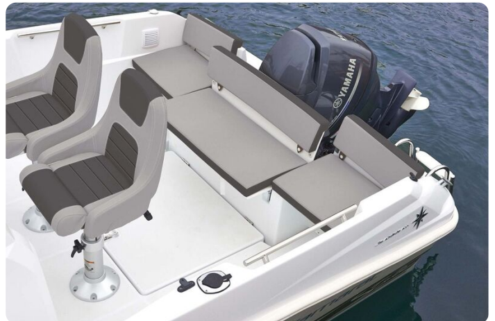
Jeanneau Cap Camarat 5.5 CC - sliding aft bench