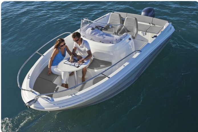
Jeanneau Cap Camarat 5.5 CC - with table in open bow