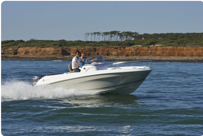
Jeanneau Cap Camarat 5.5 CC - starboard side