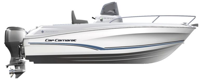
Jeanneau Cap Camarat 5.5 CC - diagram of side view