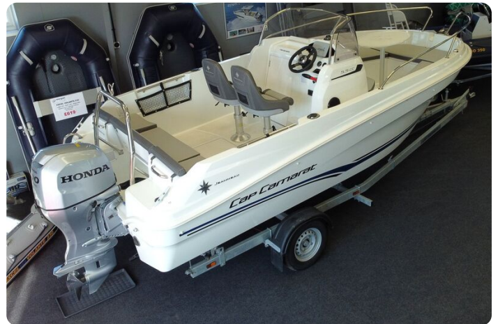
Jeanneau Cap Camarat 5.5 CC - cockpit seating and console