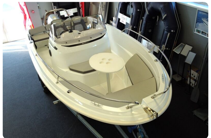
Jeanneau Cap Camarat 5.5 CC - bow seating and table