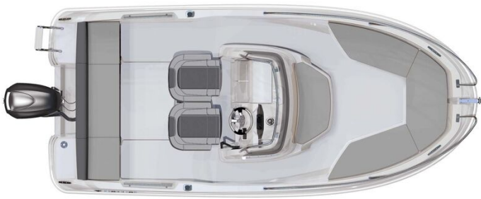
Jeanneau Cap Camarat 5.5 CC - diagram of overhead view