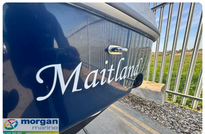
Cap Camarat 6.5 WA - name