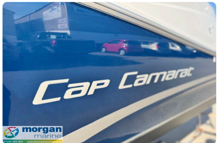
Cap Camarat 6.5 WA - brand