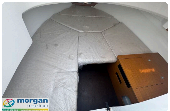
Cap Camarat 6.5 WA - main berth