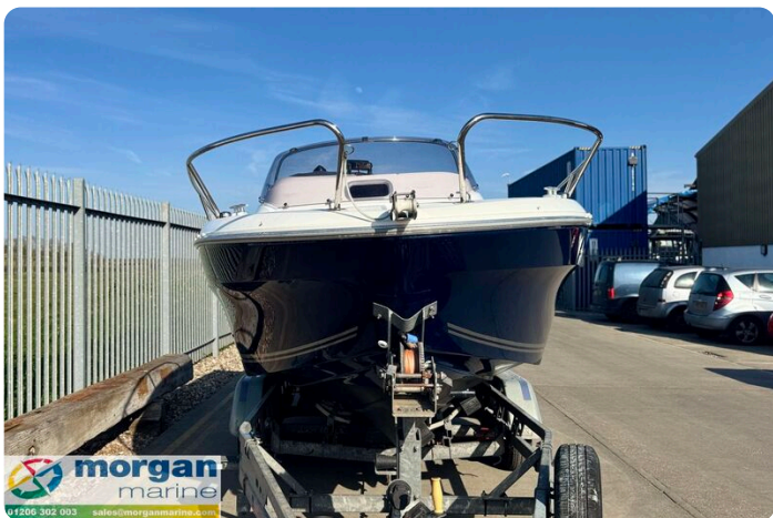
Cap Camarat 6.5 WA - bow