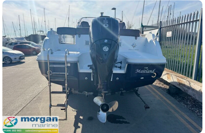
Cap Camarat 6.5 WA - engine