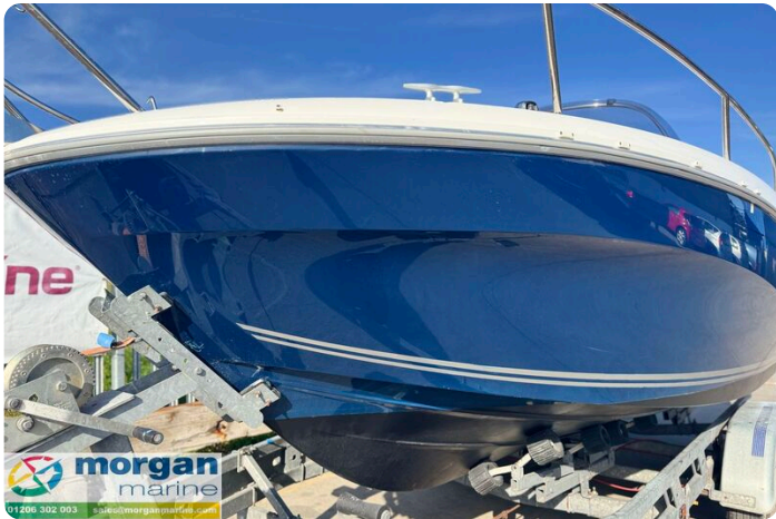
Cap Camarat 6.5 WA - polished hull