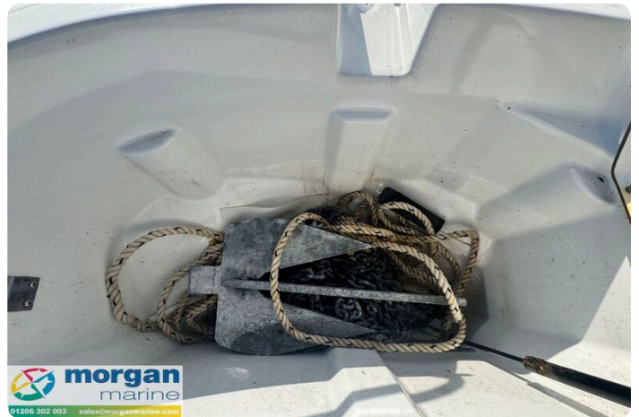
Cap Camarat 6.5 WA - anchor and chain