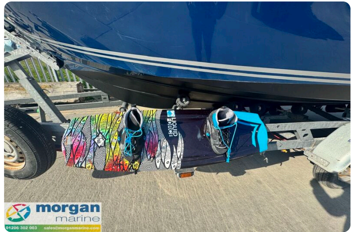
Cap Camarat 6.5 WA - wakeboard