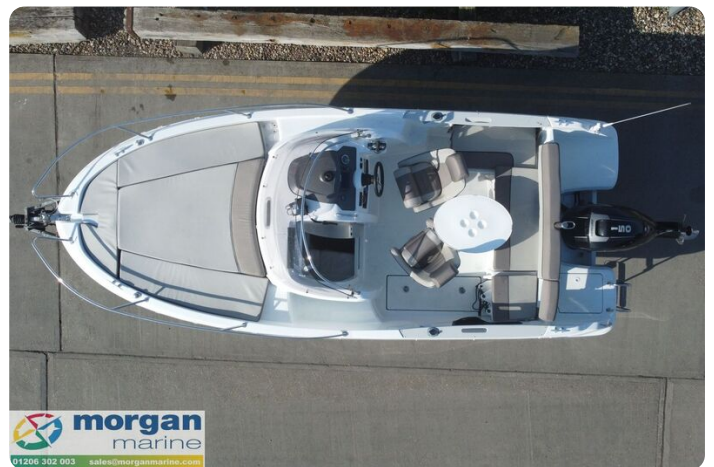
Cap Camarat 6.5 WA - top view -2