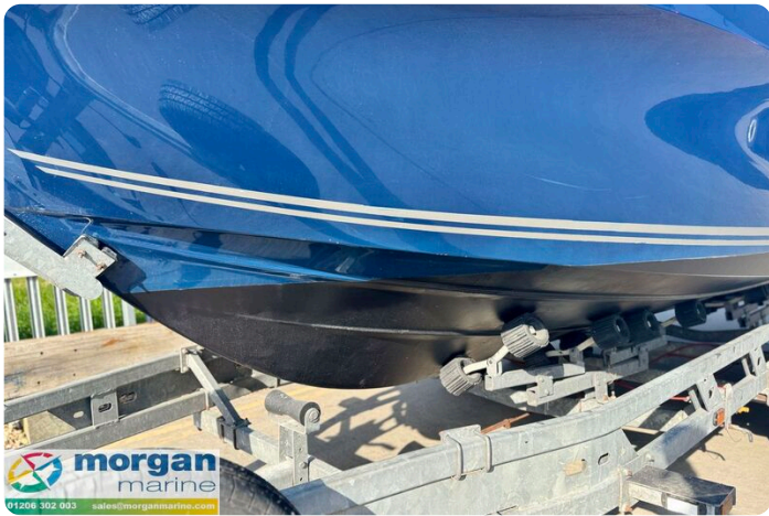
Cap Camarat 6.5 WA - hull