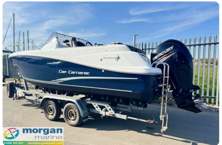
Cap Camarat 6.5 WA - back