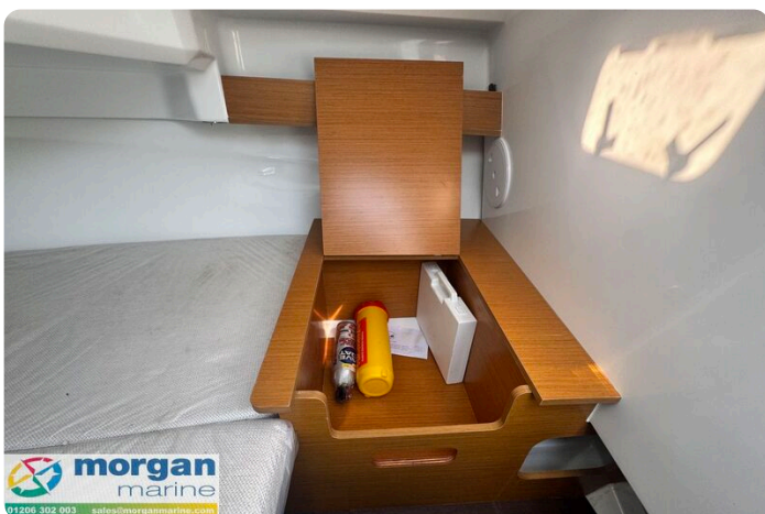
Cap Camarat 6.5 WA - storage