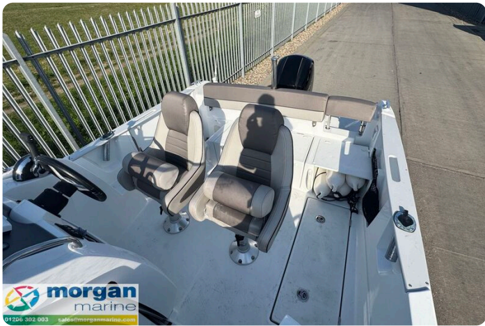
Cap Camarat 6.5 WA - bolster seats