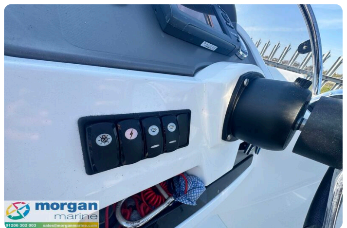
Cap Camarat 6.5 WA - buttons