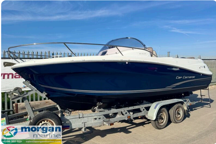
Cap Camarat 6.5 WA - Main