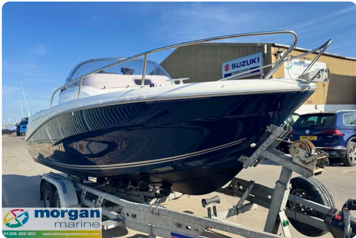
Cap Camarat 6.5 WA - front