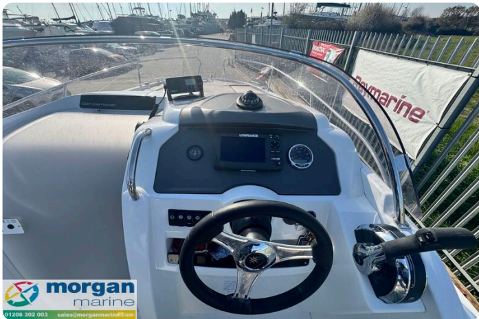
Cap Camarat 6.5 WA - dash