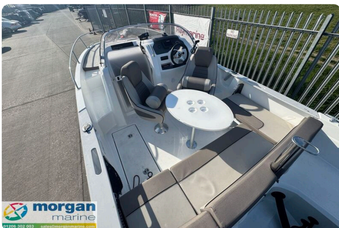
Cap Camarat 6.5 WA - table