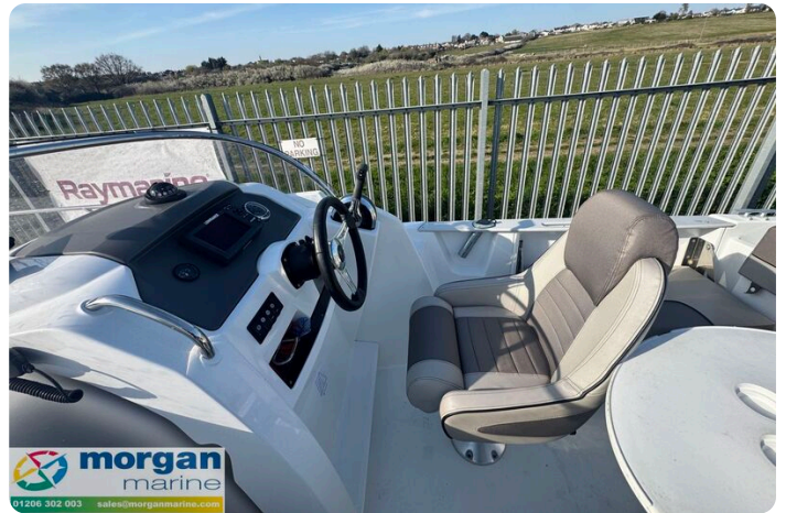
Cap Camarat 6.5 WA - pilot seat