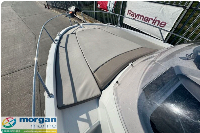
Cap Camarat 6.5 WA - sun bed