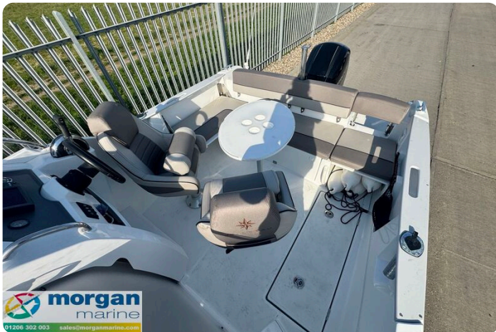
Cap Camarat 6.5 WA - bolster seats