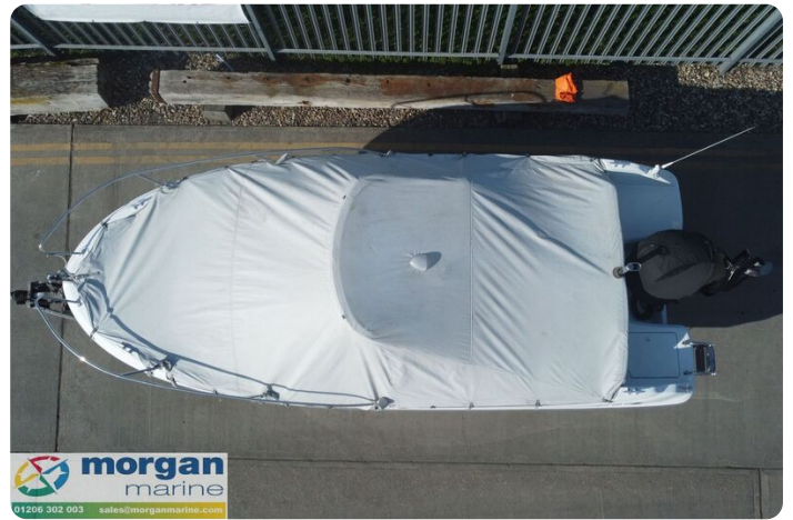
Cap Camarat 6.5 WA - top view cover