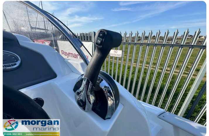
Cap Camarat 6.5 WA - throttle control