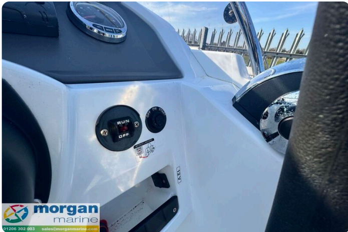
Cap Camarat 6.5 WA - key start