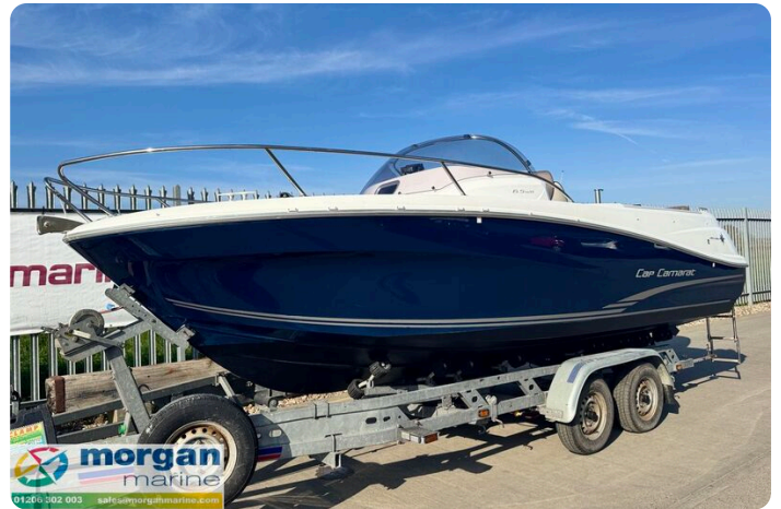
Cap Camarat 6.5 WA - side