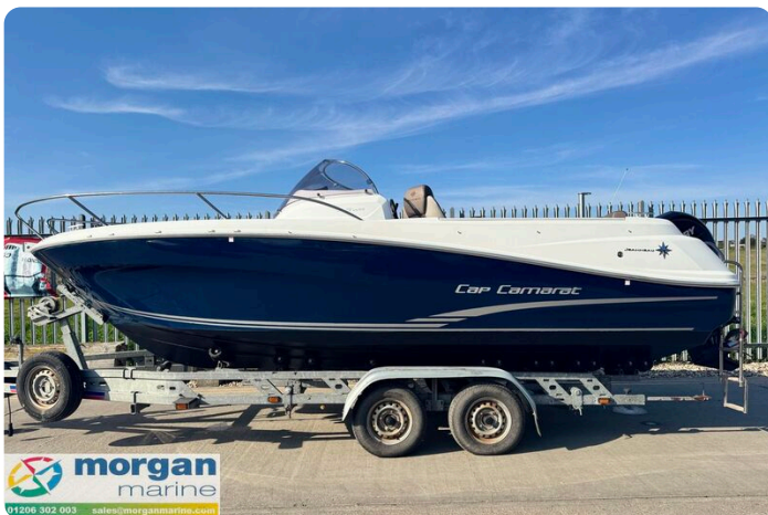
Cap Camarat 6.5 WA - side view