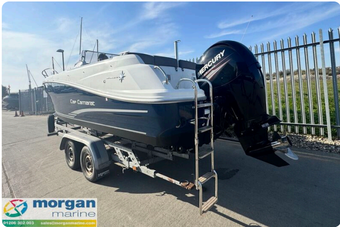
Cap Camarat 6.5 WA - ladder