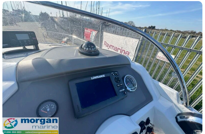
Cap Camarat 6.5 WA - chart plotter