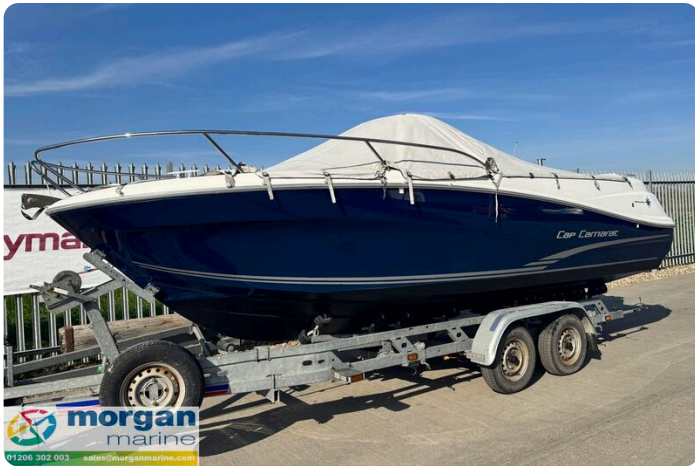
Cap Camarat 6.5 WA - full cover