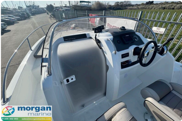
Cap Camarat 6.5 WA - door