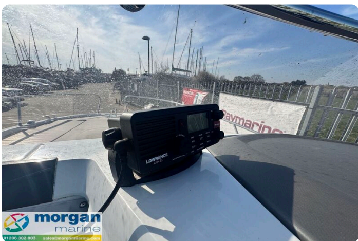
Cap Camarat 6.5 WA - VHF