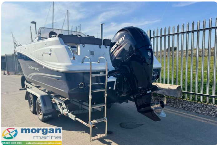
Cap Camarat 6.5 WA - boarding ladder