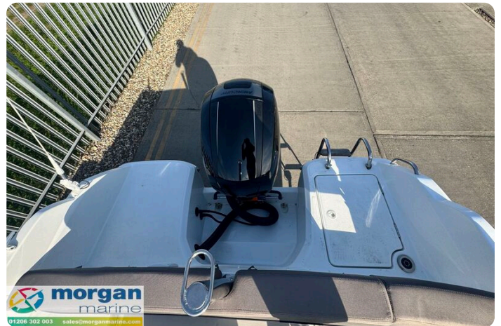
Cap Camarat 6.5 WA - engine