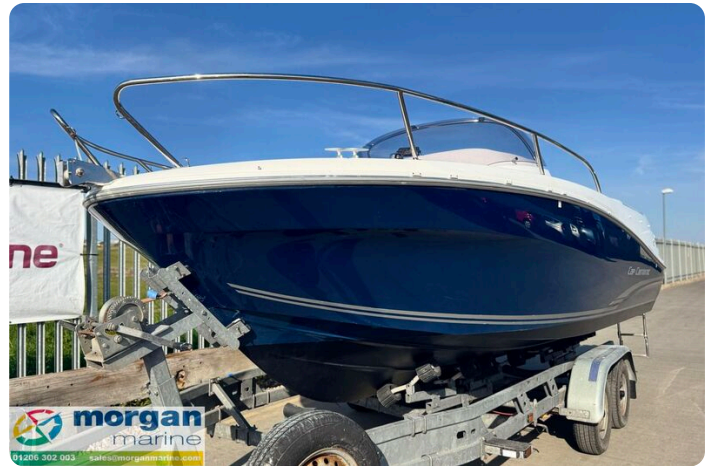
Cap Camarat 6.5 WA - railings