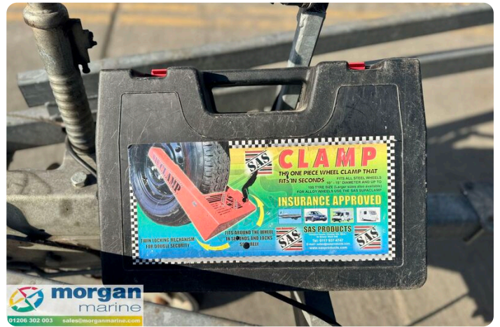
Cap Camarat 6.5 WA - wheel clamp