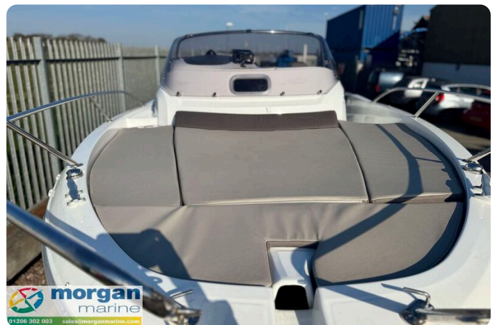
Cap Camarat 6.5 WA - sun bed cushions