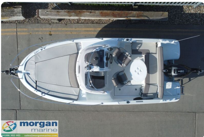
Cap Camarat 6.5 WA - top view