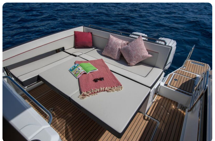
Jeanneau Cap Camarat 9.0 WA - aft cockpit sun lounger