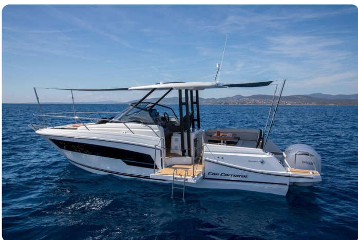
Jeanneau Cap Camarat 9.0 WA - port side folding terrace to increase cockpit space and give easy access to the sea