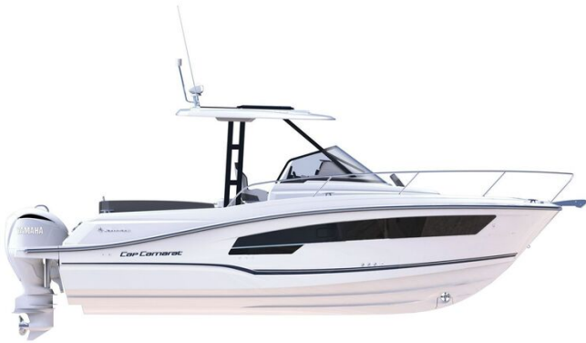
Jeanneau Cap Camarat 9.0 WA - diagram of side view