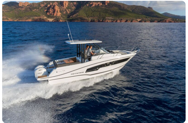
Jeanneau Cap Camarat 9.0 WA - starboard side