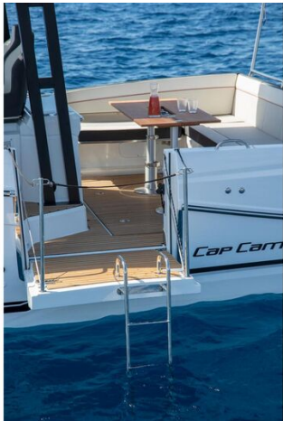
Jeanneau Cap Camarat 9.0 WA - port side terrace with boarding ladder