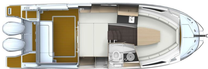
Jeanneau Cap Camarat 9.0 WA - diagram of cabins layout