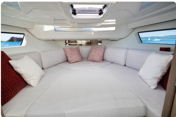
Jeanneau Cap Camarat 9.0 WA Series 2 - forward cabin with island double berth