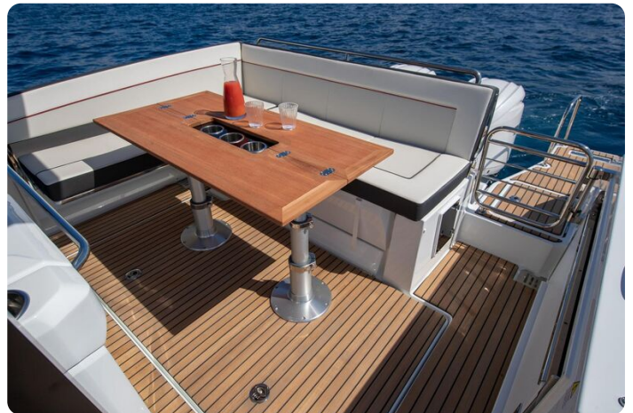
Jeanneau Cap Camarat 9.0 WA - aft cockpit seating and table