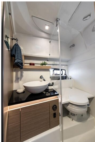
Jeanneau Cap Camarat 9.0 WA Series 2 -