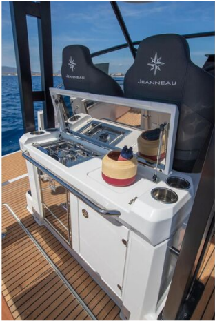
Jeanneau Cap Camarat 9.0 WA - exterior galley