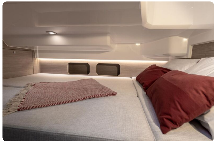
Jeanneau Cap Camarat 9.0 WA Series 2 - aft cabin