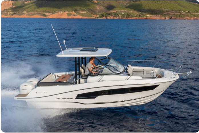
Jeanneau Cap Camarat 9.0 WA Series 2