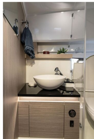
Jeanneau Cap Camarat 9.0 WA - wash basin in toilet compartment