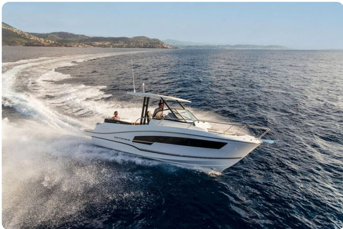
Jeanneau Cap Camarat 9.0 WA - with long wake