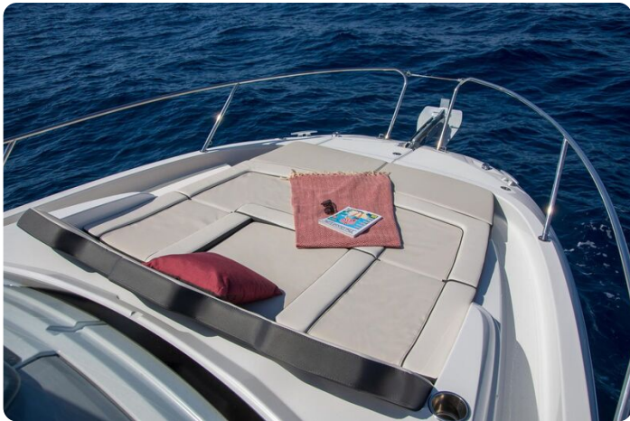
Jeanneau Cap Camarat 9.0 WA - bow sun lounger with infill cushion