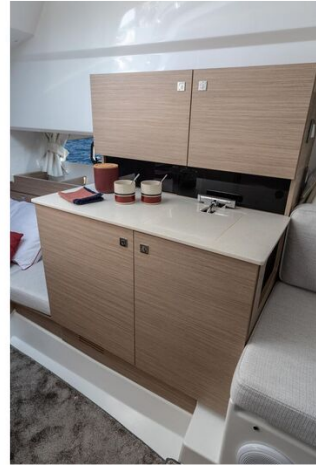
Jeanneau Cap Camarat 9.0 WA Series 2 - interior galley and saloon