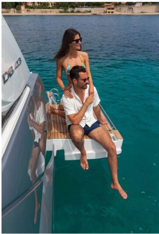
Jeanneau DB 43 inboard - relaxing on the port side terrace