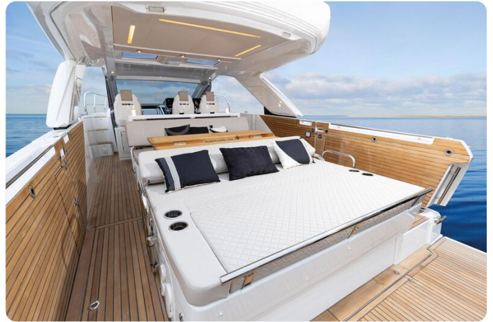
Jeanneau DB 43 inboard - aft sun lounger