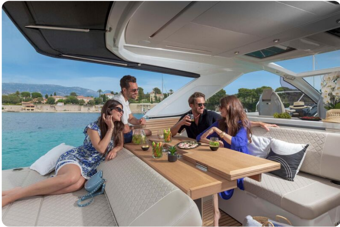
Jeanneau DB 43 inboard - sitting at cockpit table