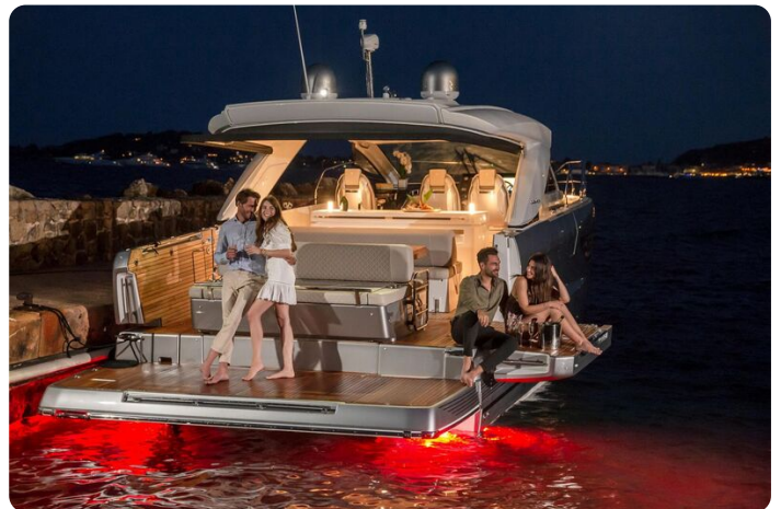
Jeanneau DB 43 inboard - socialising at night on the terraces with under water lights