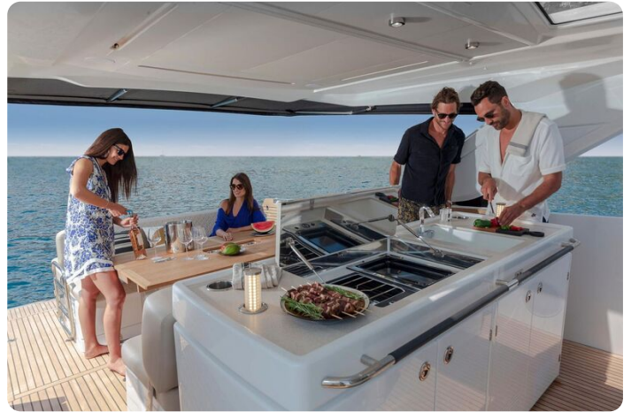
Jeanneau DB 43 inboard - cockpit galley