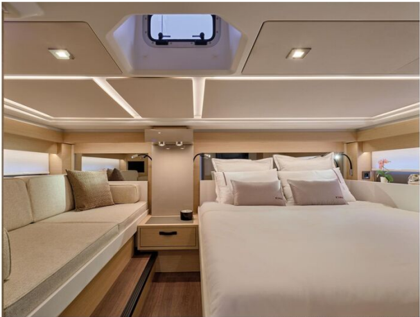
Jasmeau DB 43 - Attention obligatoire / Mandatory credits Photo Nicolas Claris