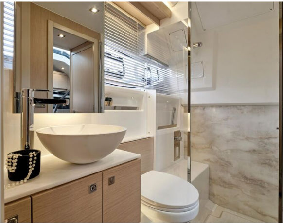
Jasmeau DB 43 - Attention obligatoire / Mandatory credits Photo Nicolas Claris