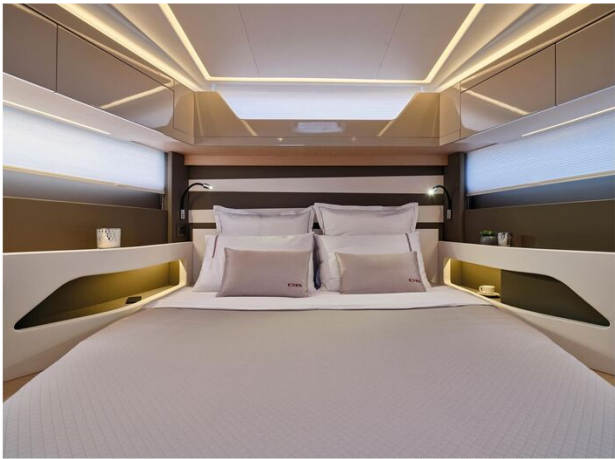
Jasmeau DB 43 - Attention obligatoire / Mandatory credits Photo Nicolas Claris