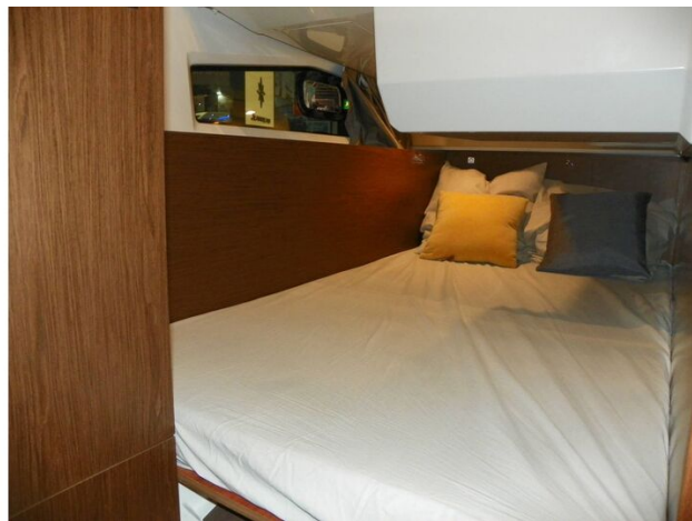
Jeanneau Merry Fisher 1095 - 3rd cabin