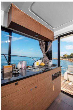
Jeanneau Merry Fisher 1095 - galley area