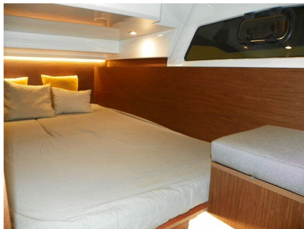
Jeanneau Merry Fisher 1095 - 2nd cabin