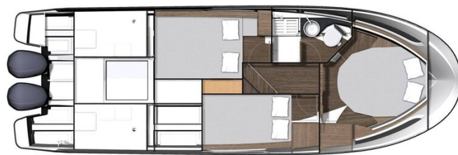
Jeanneau Merry Fisher 1095 - diagram of cabin layout