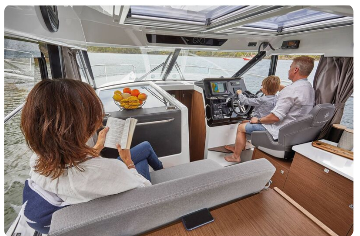
Jeanneau Merry Fisher 1095 - co-pilot bench