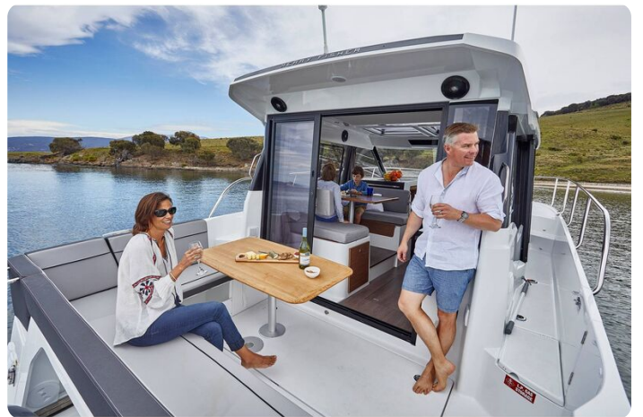
Jeanneau Merry Fisher 1095 - cockpit saloon and side deck