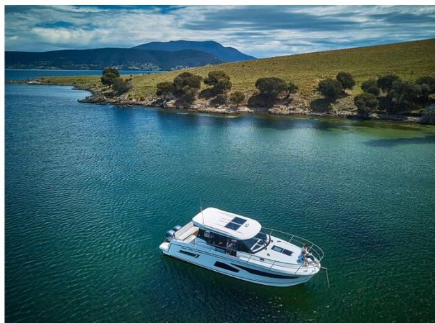
Jeanneau Merry Fisher 1095 - in beautiful surroundings