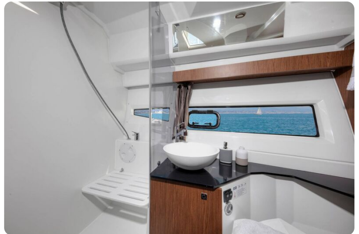
Jeanneau Merry Fisher 1095 - toilet and shower compartment