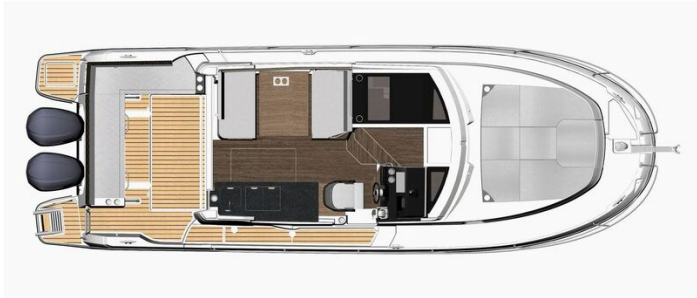
Jeanneau Merry Fisher 1095 - diagram of overhead view