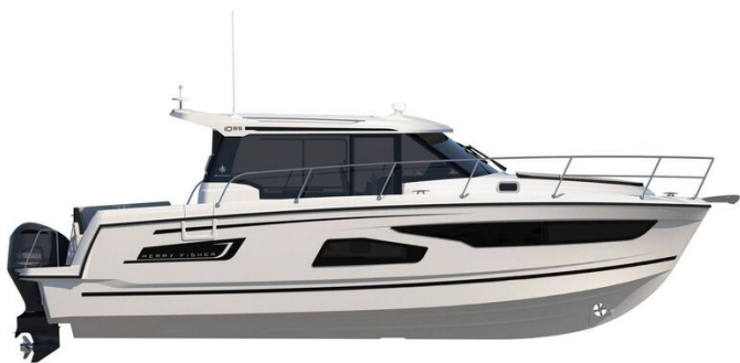
Jeanneau Merry Fisher 1095 - diagram of side view