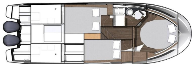
Jeanneau Merry Fisher 1095 - diagram of cabin layout