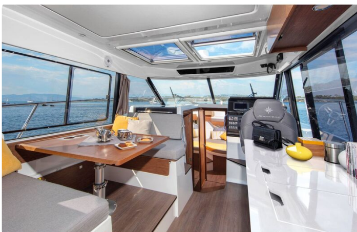
Jeanneau Merry Fisher 1095 - wheelhouse interior