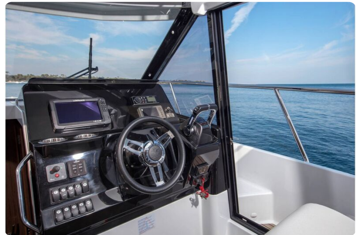
Jeanneau Merry Fisher 1095 - helm position and starboard side door