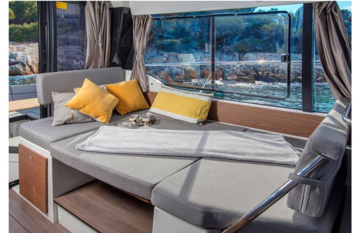
Jeanneau Merry Fisher 1095 - wheelhouse saloon converts to double berth