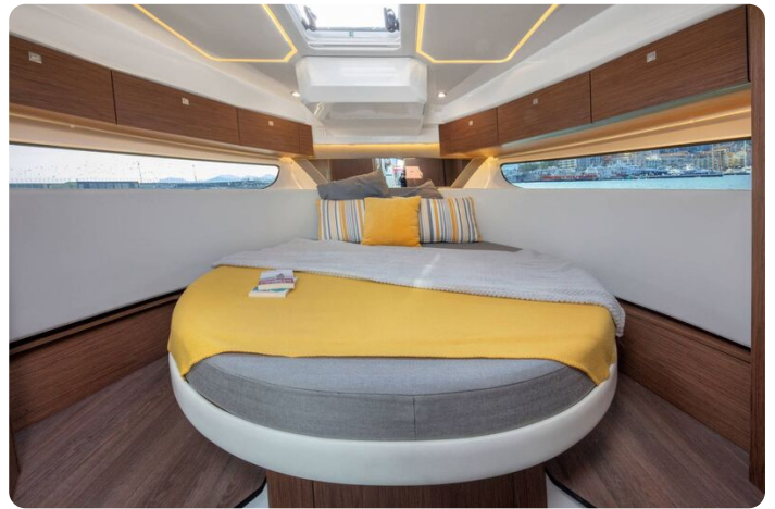
Jeanneau Merry Fisher 1095 - main cabin with double berth and hatch to deck