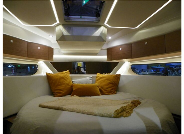
Jeanneau Merry Fisher 1095 - LED lights in the cabins