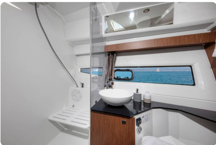
Jeanneau Merry Fisher 1095 - toilet and shower