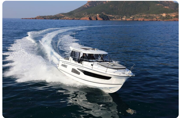
Jeanneau Merry Fisher 1095 - on the water