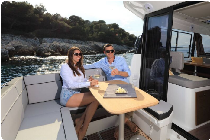
Jeanneau Merry Fisher 1095 - cockpit U shape saloon seating and table