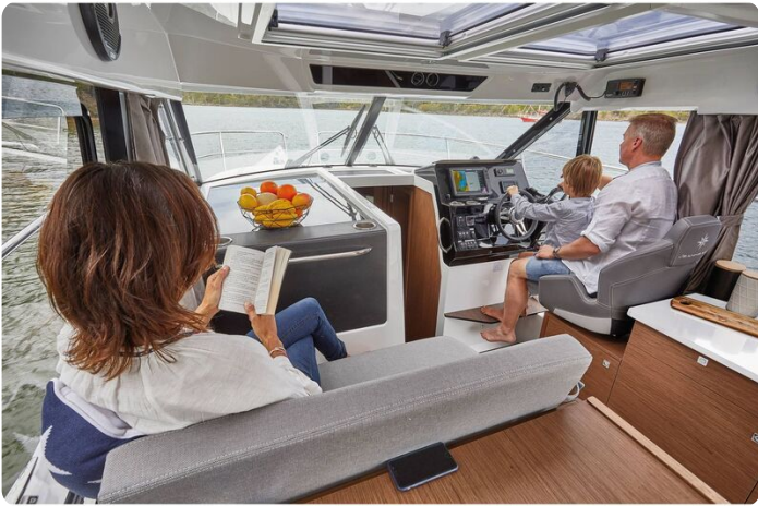
Jeanneau Merry Fisher 1095 - co-pilot seat and pilot seat