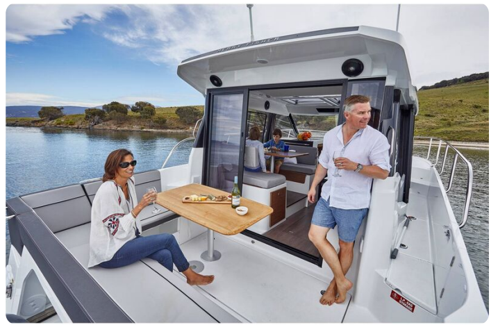
Jeanneau Merry Fisher 1095 - view from cockpit to wheelhouse