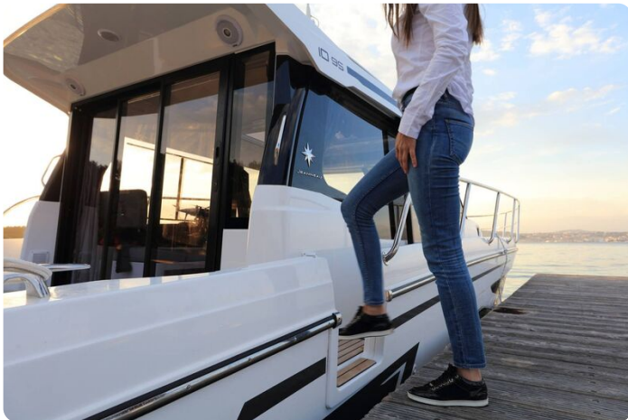
Jeanneau Merry Fisher 1095 - cockpit side gate for easy access from pontoon