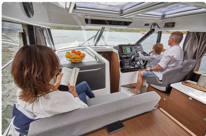
Jeanneau Merry Fisher 1095 - co-pilot seat and pilot seat