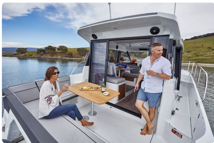
Jeanneau Merry Fisher 1095 - view from cockpit to wheelhouse