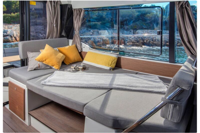
Jeanneau Merry Fisher 1095 - table in wheelhouse converts to berth