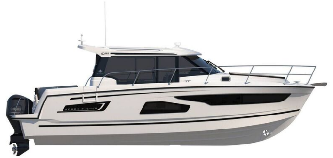
Jeanneau Merry Fisher 1095 - diagram of starboard side