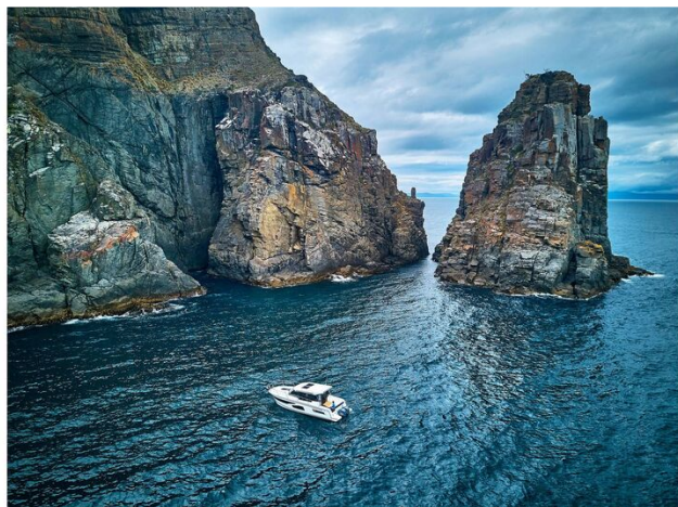
Jeanneau Merry Fisher 1095 - in beautiful surroundings