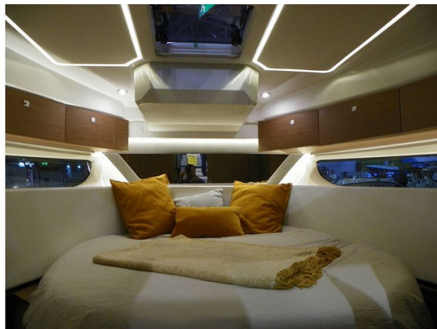
Jeanneau Merry Fisher 1095 - LED lights in the cabins