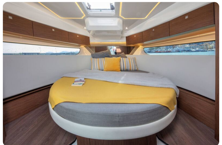
Jeanneau Merry Fisher 1095 - main cabin with double berth and hatch to deck