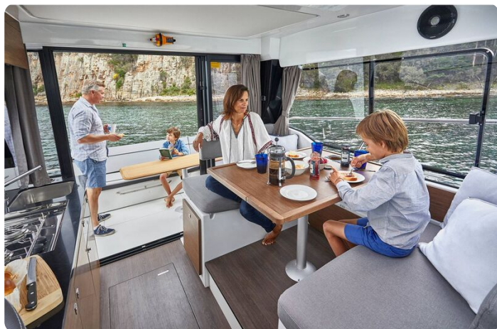
Jeanneau Merry Fisher 1095 - view from wheelhouse to cockpit