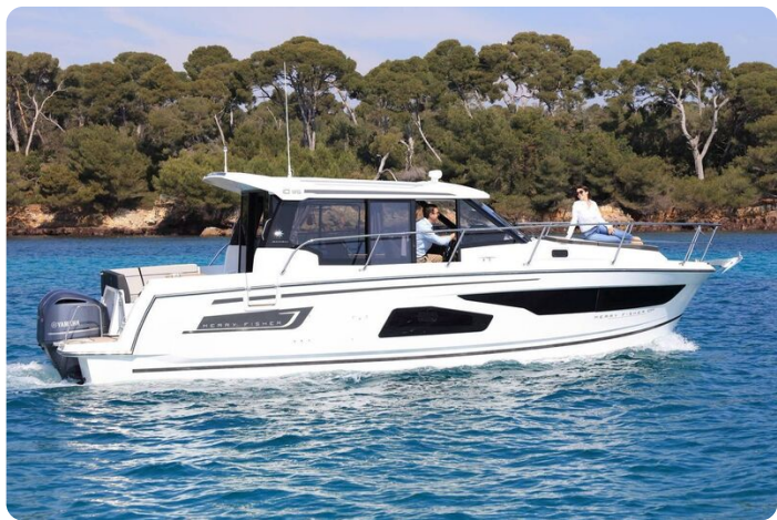
Jeanneau Merry Fisher 1095