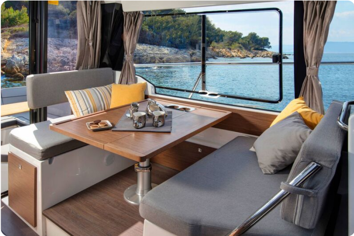
Jeanneau Merry Fisher 1095 - wheelhouse saloon seating and table