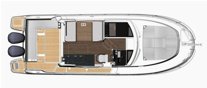
Jeanneau Merry Fisher 1095 - diagram of wheelhouse and bow