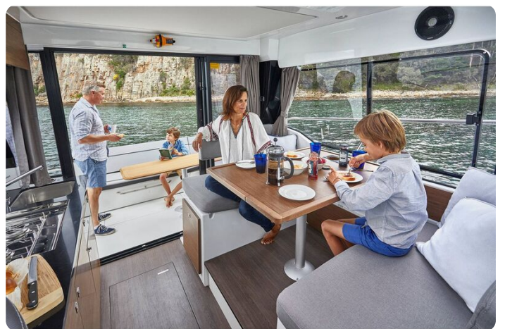
Jeanneau Merry Fisher 1095 - view from wheelhouse to cockpit