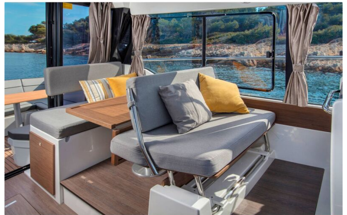
Jeanneau Merry Fisher 1095 - table folds and forward seat converts to co-pilot seat