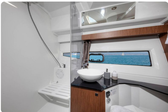
Jeanneau Merry Fisher 1095 - toilet and shower