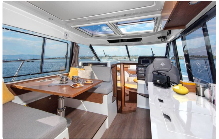
Jeanneau Merry Fisher 1095 - wheelhouse with port side seating and starboard side helm position and galley