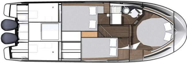
Jeanneau Merry Fisher 1095 - diagram of cabin layout