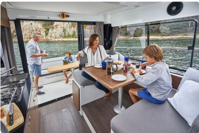
Jeanneau Merry Fisher 1095 - view from wheelhouse to cockpit