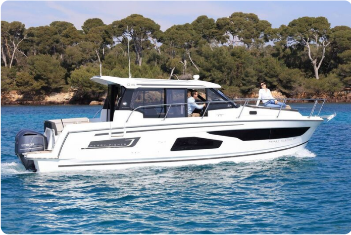
Jeanneau Merry Fisher 1095