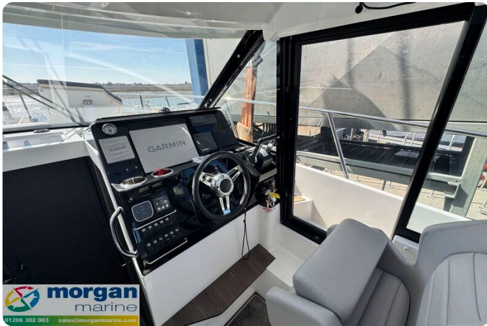
Merry Fisher 1095 - covers