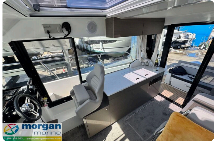
Merry Fisher 1095 - pilot seat