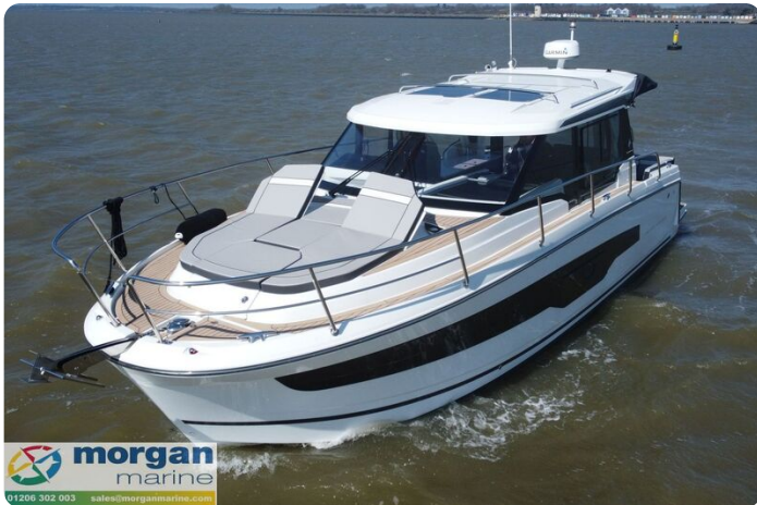
Merry Fisher 1095 - sun-pads