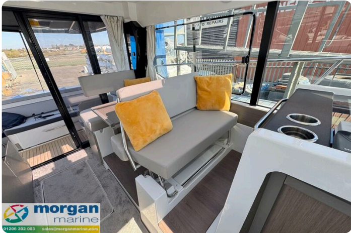
Merry Fisher 1095 - co pilot seat