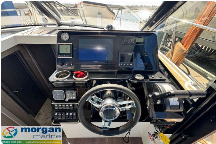
Merry Fisher 1095 - wheel