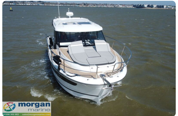
Merry Fisher 1095 - bow seating