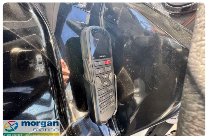
Merry Fisher 1095 - radio