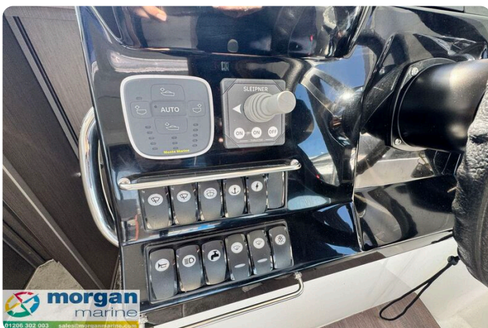
Merry Fisher 1095 - bow thruster