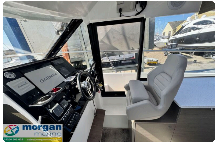
Merry Fisher 1095 - pilot seating