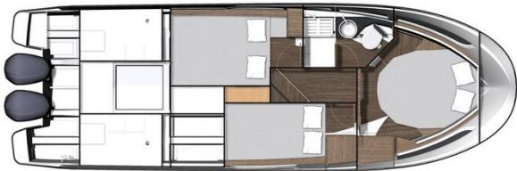
Jeanneau Merry Fisher 1095 Flybridge - diagram of cabins layout