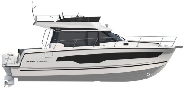
Jeanneau Merry Fisher 1095 Flybridge - diagram of starboard side