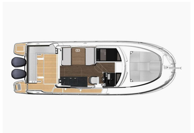
Jeanneau Merry Fisher 1095 Flybridge - diagram of wheelhouse layout