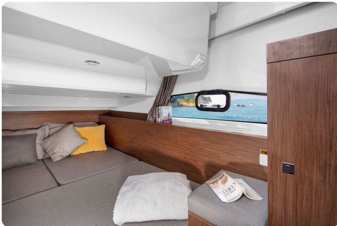
Jeanneau Merry Fisher 1095 Flybridge - 2nd cabin