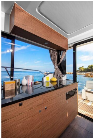
Jeanneau Merry Fisher 1095 Flybridge - wheelhouse galley