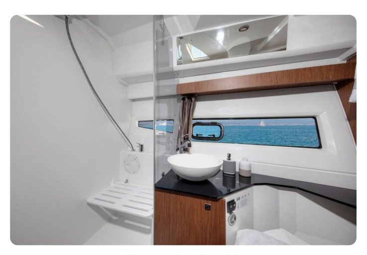
Jeanneau Merry Fisher 1095 Fly - toilet and shower compartment