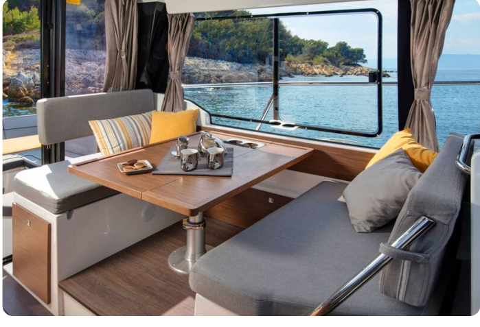
Jeanneau Merry Fisher 1095 Fly - wheelhouse saloon