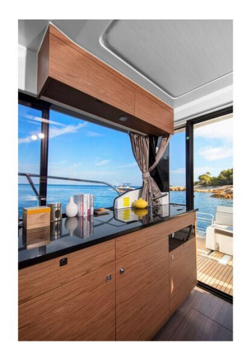
Jeanneau Merry Fisher 1095 Fly - wheelhouse galley