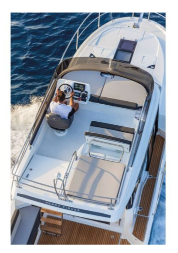
Jeanneau Merry Fisher 1095 Fly - overhead view of flybridge