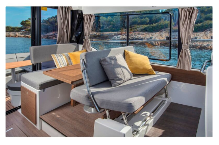
Jeanneau Merry Fisher 1095 Fly - co-pilot bench seat converts to saloon seating