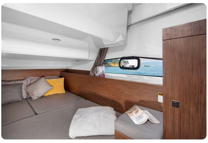
Jeanneau Merry Fisher 1095 Fly - 2nd cabin