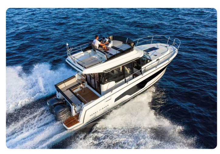
Jeanneau Merry Fisher 1095 Fly