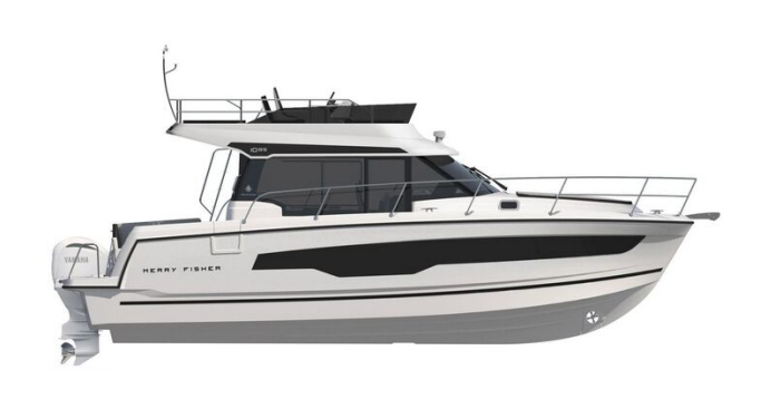
Jeanneau Merry Fisher 1095 Fly - diagram of side view