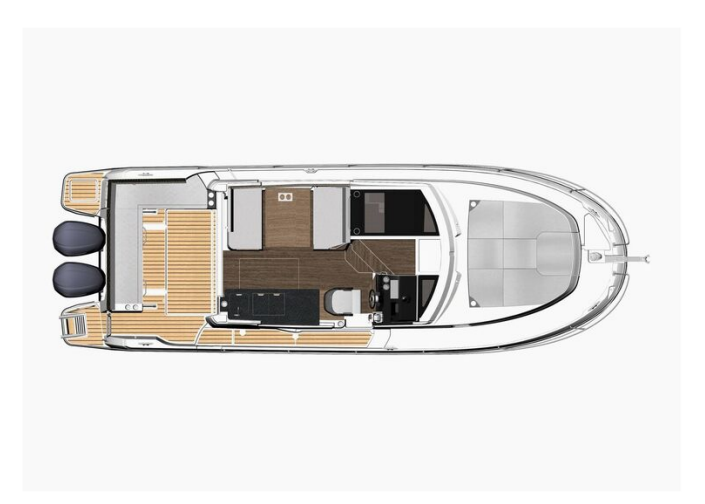
Jeanneau Merry Fisher 1095 Fly - diagram of top view and wheelhouse interior