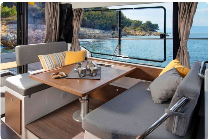
Jeanneau Merry Fisher 1095 Fly - wheelhouse saloon