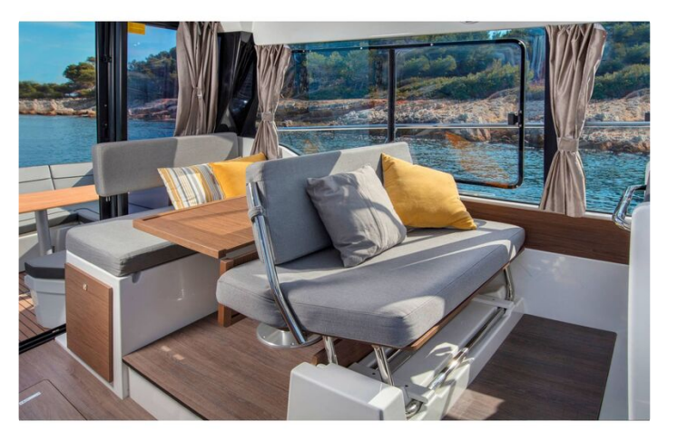
Jeanneau Merry Fisher 1095 Flybridge - co-pilot seat converts to seating at table