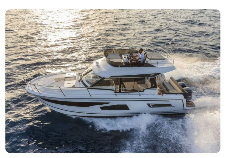
Jeanneau Merry Fisher 1095 Flybridge - overhead view from port side