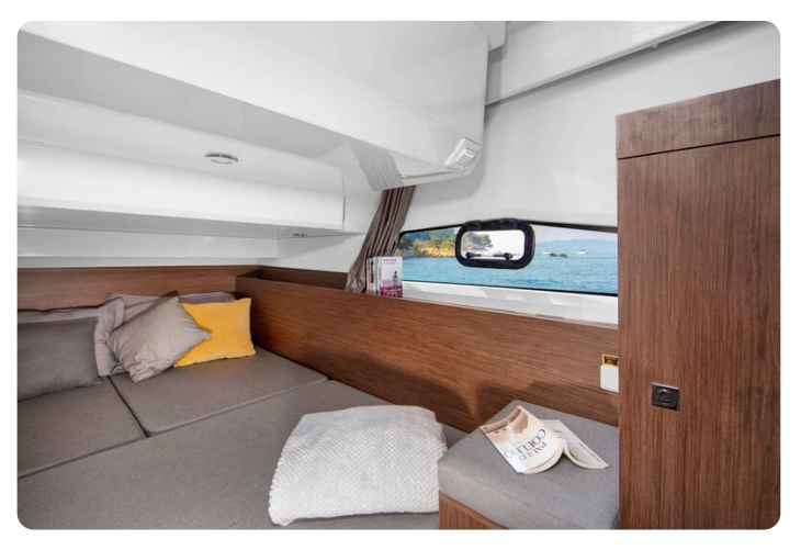
Jeanneau Merry Fisher 1095 Flybridge - 3rd cabin