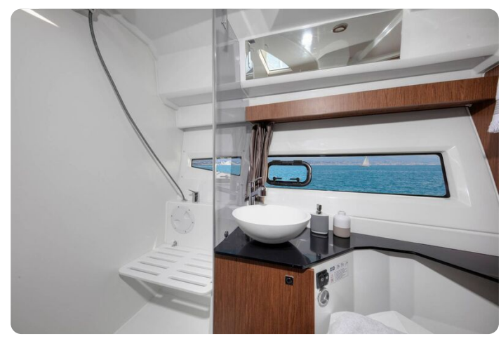
Jeanneau Merry Fisher 1095 Flybridge - toilet and shower compartment