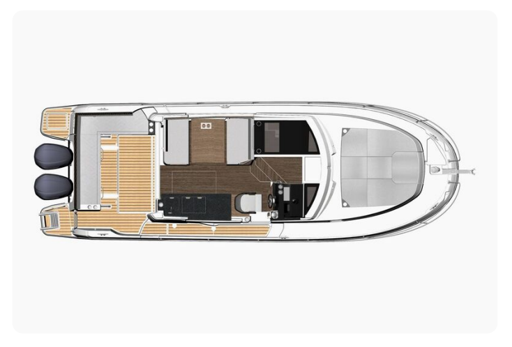
Jeanneau Merry Fisher 1095 Flybridge - diagram off cockpit + bow seating and wheelhouse interior