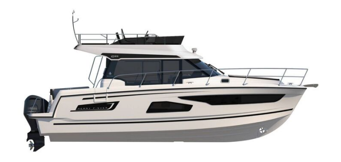
Jeanneau Merry Fisher 1095 Flybridge - diagram of side view