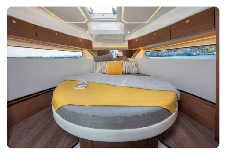
Jeanneau Merry Fisher 1095 Flybridge - forward cabin with island double berth and roof hatches