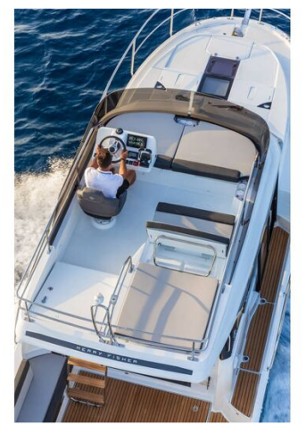
Jeanneau Merry Fisher 1095 Flybridge - overhead view of flybridge