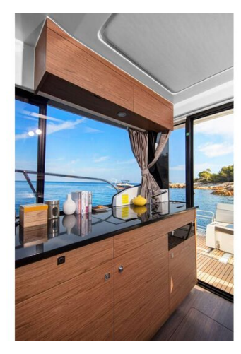
Jeanneau Merry Fisher 1095 Flybridge - wheelhouse port side galley