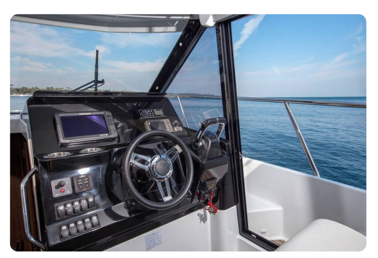
Jeanneau Merry Fisher 1095 Flybridge - helm position