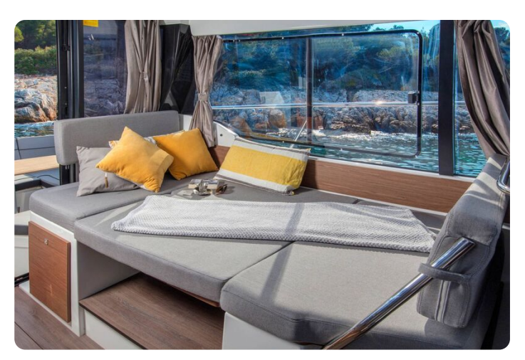
Jeanneau Merry Fisher 1095 Flybridge - wheelhouse saloon table converts to berth