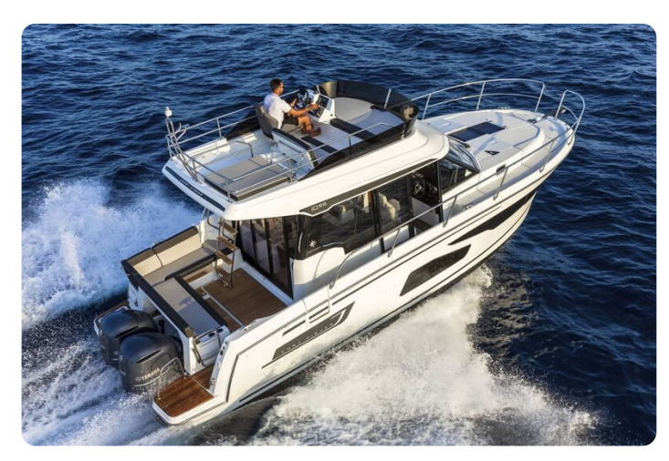
Jeanneau Merry Fisher 1095 Flybridge