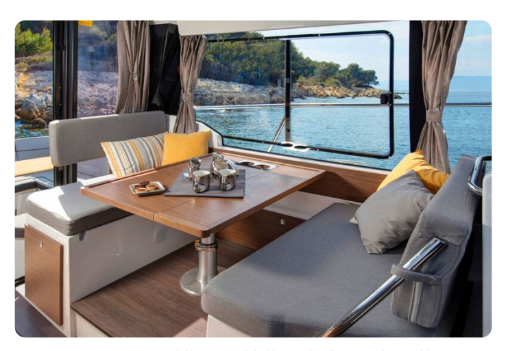
Jeanneau Merry Fisher 1095 Flybridge - wheelhouse saloon table