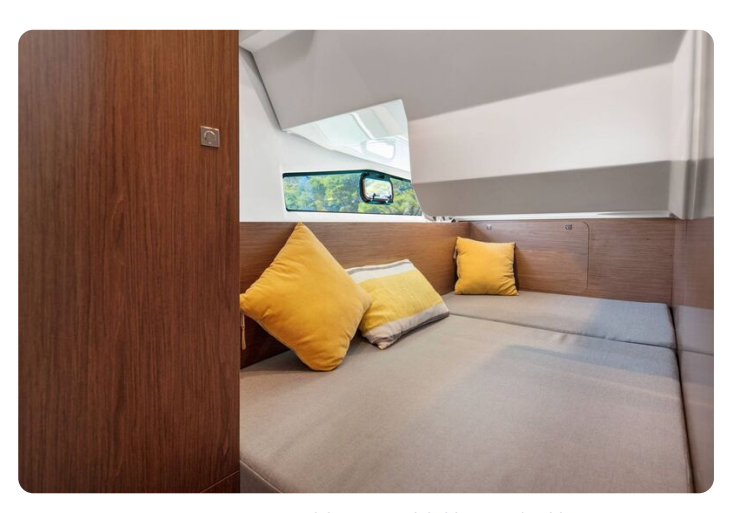
Jeanneau Merry Fisher 1095 Flybridge - 2nd cabin