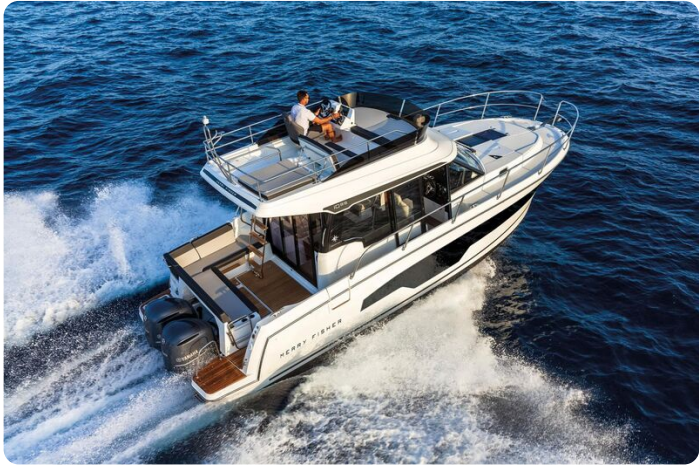
Jeanneau Merry Fisher 1095 Flybridge