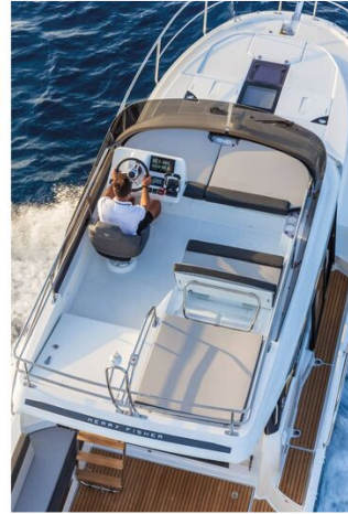
Jeanneau Merry Fisher 1095 Flybridge - overhead view of flybridge