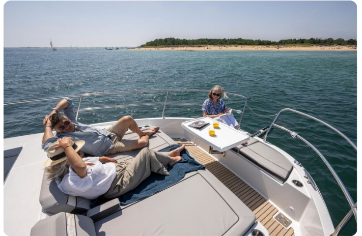
Jeanneau Merry Fisher 1295 Coupe - bow cockpit seating