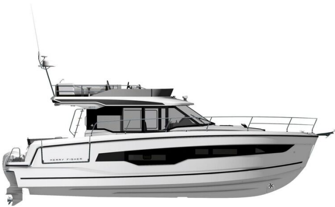
Jeanneau Merry Fisher 1295 Flybridge - diagram of side view