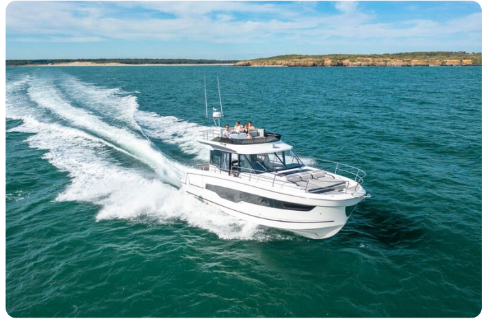
Jeanneau Merry Fisher 1295 Flybridge - on the water