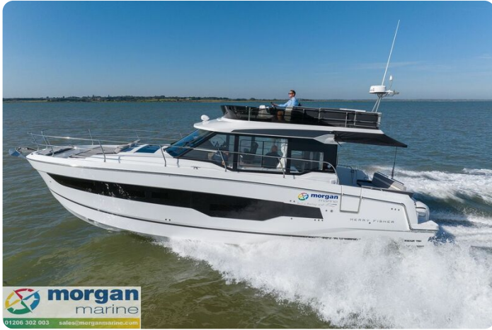
Jeanneau Merry Fisher 1295 Flybridge