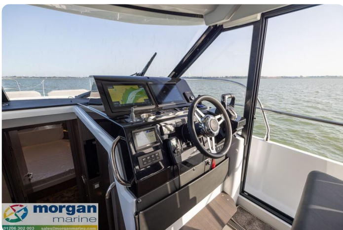
Jeanneau Merry Fisher 1295 Flybridge - helm position with side door