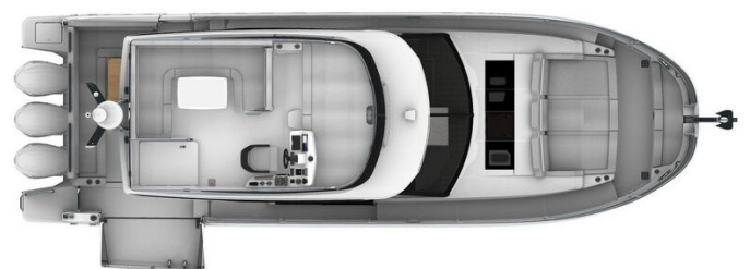
Jeanneau Merry Fisher 1295 Flybridge - diagram of overhead layout