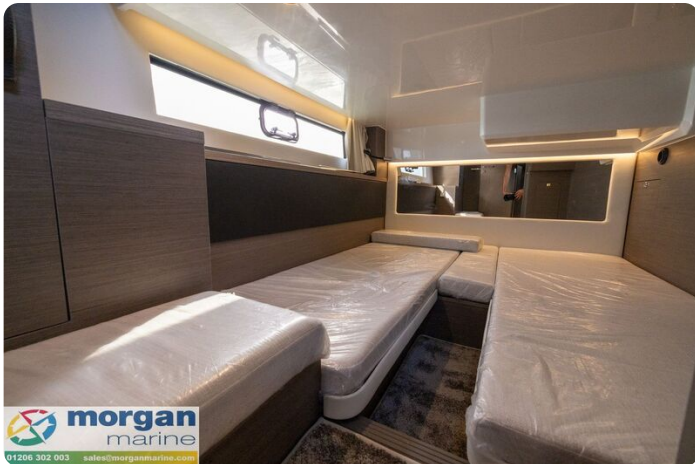
Jeanneau Merry Fisher 1295 Flybridge - 2nd cabin