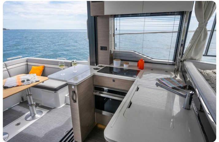
Jeanneau Merry Fisher 1295 Flybridge - galley