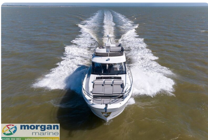
Jeanneau Merry Fisher 1295 Fly - overhead view coming towards camera