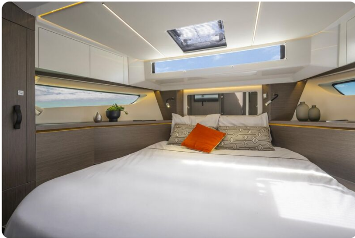
Jeanneau Merry Fisher 1295 Flybridge - forward cabin with double berth and roof hatch