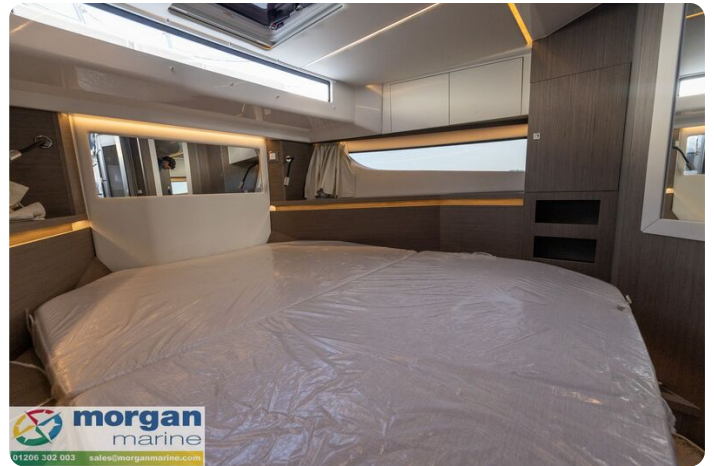
Jeanneau Merry Fisher 1295 Flybridge - 2nd cabin