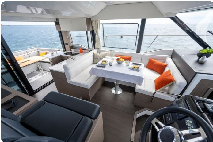
Jeanneau Merry Fisher 1295 Flybridge - wheelhouse saloon