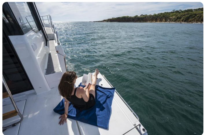
Jeanneau Merry Fisher 1295 Flybridge - folding terrace