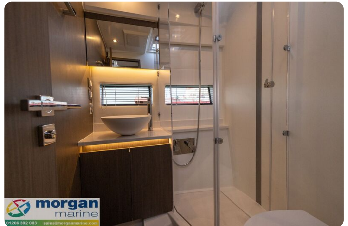
Jeanneau Merry Fisher 1295 Flybridge - toilet compartment with shower