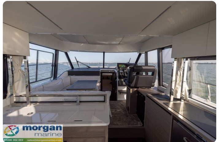
Jeanneau Merry Fisher 1295 Flybridge - wheelhouse saloon with galley