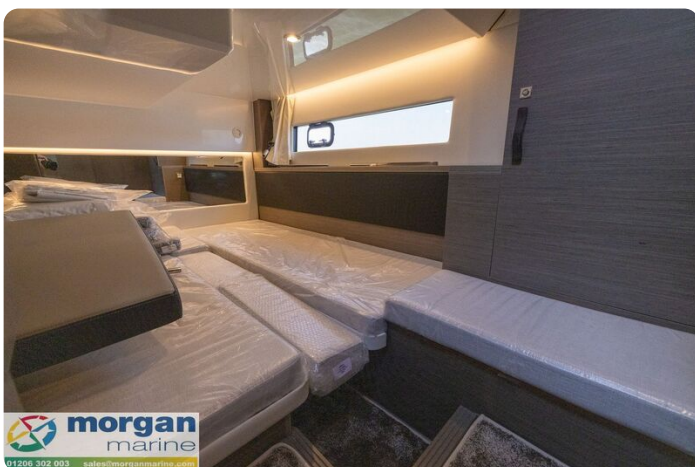
Jeanneau Merry Fisher 1295 Flybridge - 3rd cabin with two single berths