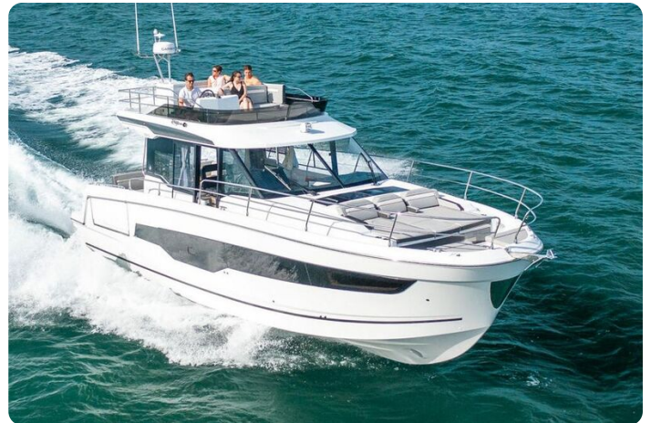
Jeanneau Merry Fisher 1295 Flybridge