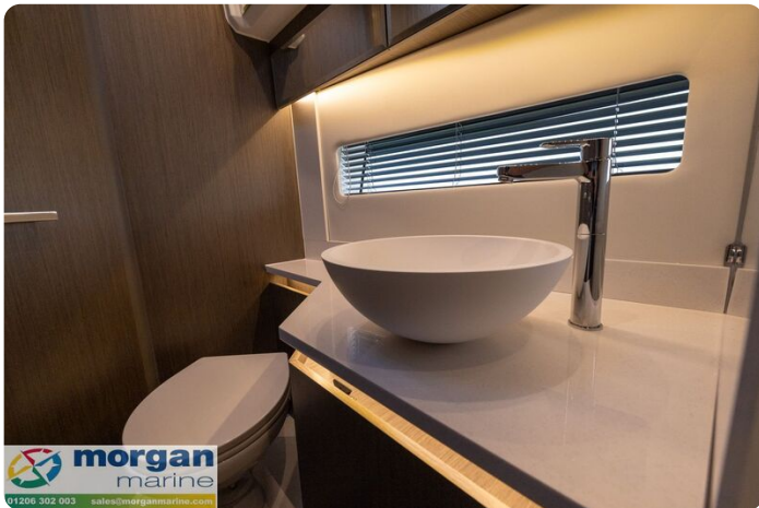
Jeanneau Merry Fisher 1295 Flybridge - toilet compartment