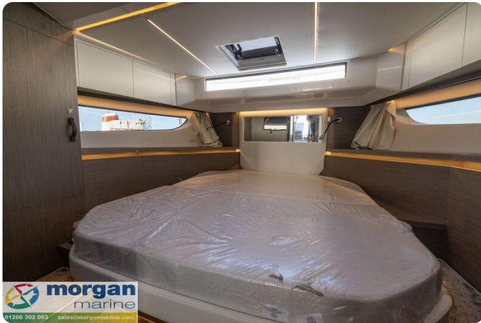
Jeanneau Merry Fisher 1295 Flybridge - forward cabin with double berth