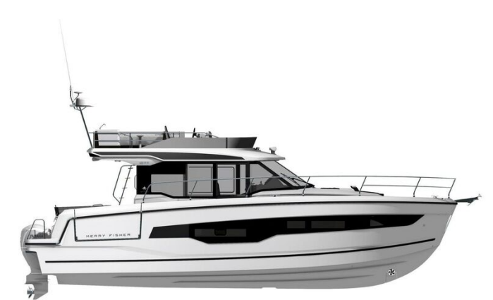
Jeanneau Merry Fisher 1295 Flybridge - diagram of side view