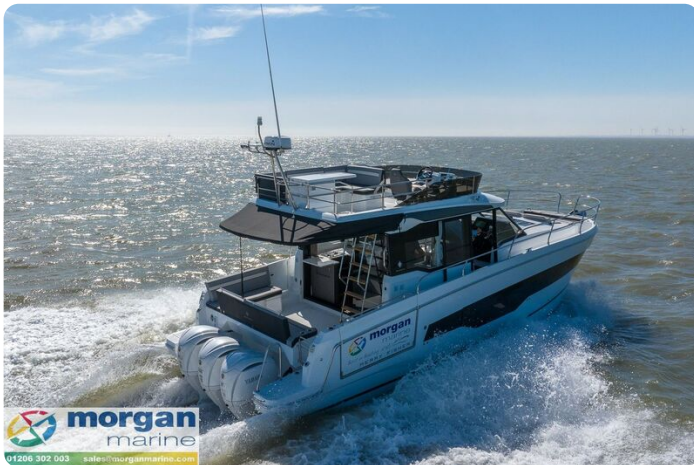
Jeanneau Merry Fisher 1295 Flybridge - overhead view from starboard side aft