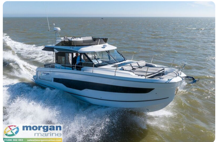
Jeanneau Merry Fisher 1295 Flybridge - overhead view from starboard side