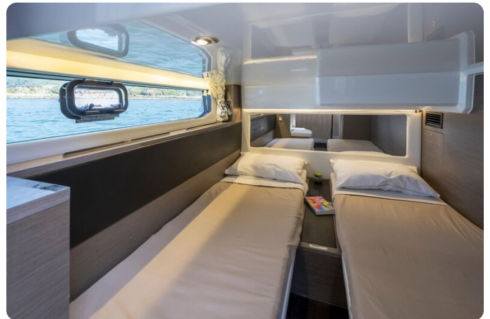
Jeanneau Merry Fisher 1295 Flybridge - port side aft cabin