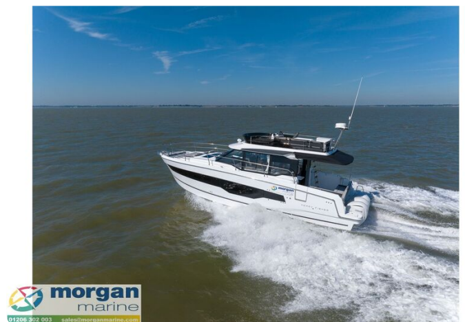
Jeanneau Merry Fisher 1295 Flybridge - port side on the water