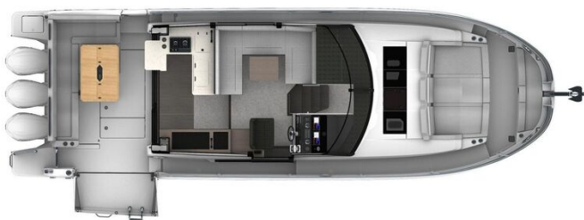
Jeanneau Merry Fisher 1295 Flybridge - diagram of wheelhouse interior