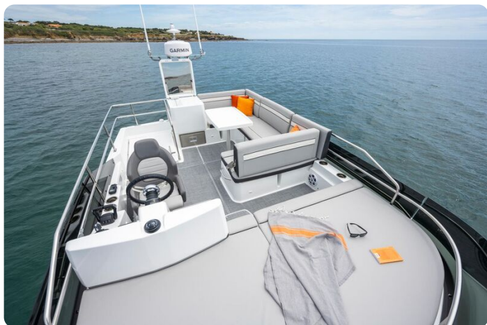
Jeanneau Merry Fisher 1295 Flybridge - flybridge