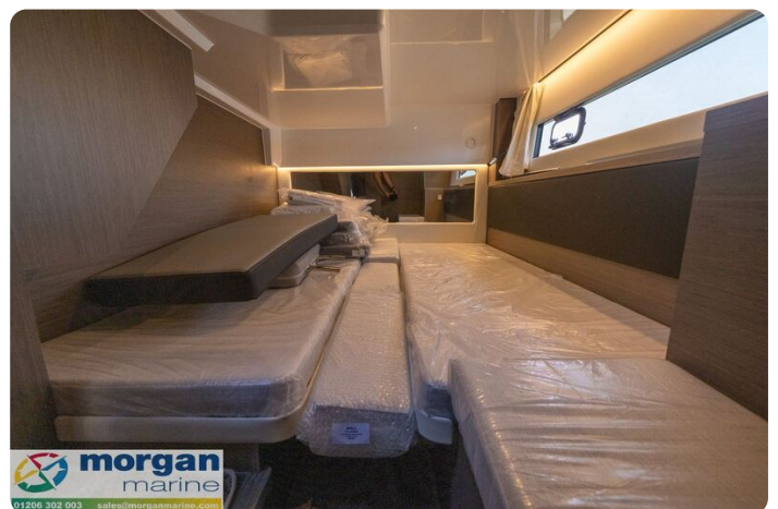
Jeanneau Merry Fisher 1295 Flybridge - 3rd cabin with two single berths and infill