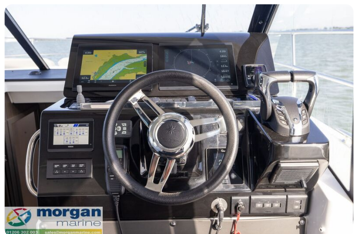
Jeanneau Merry Fisher 1295 Flybridge - dash and engine controls